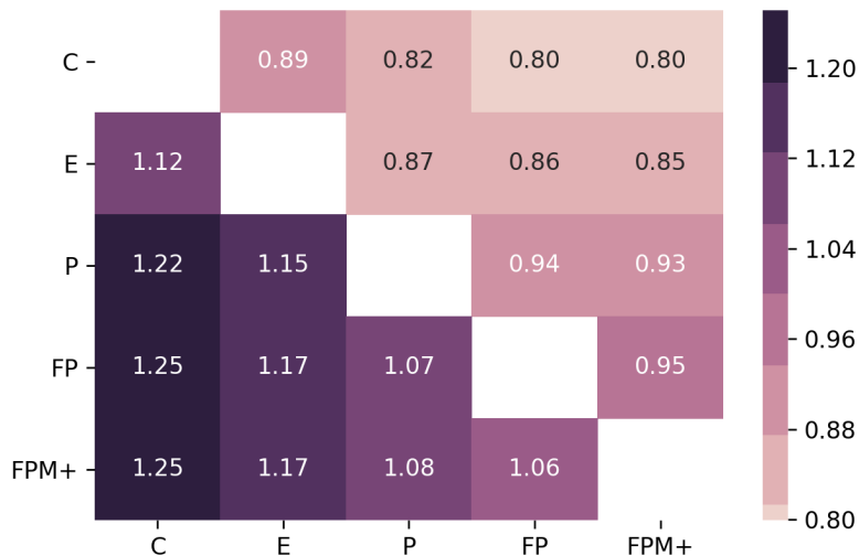
Figure 4: The cells in the heatmap show the median ratios of runtimes (column model divided by row model) over the ca. 75% of test instances which exhibited noticeable performance differences.

nentially many fully specified operation modes. We solved this by developing a different formulation of the model which uses fully specified operation modes. We determined the set of fully specified operation modes for our new model by enumeration of fully specified operation modes contained in the original model, and used bound propagation to filter out those that are physically infeasible. In addition, we developed different versions of our model by incorporating additional bounds into it.