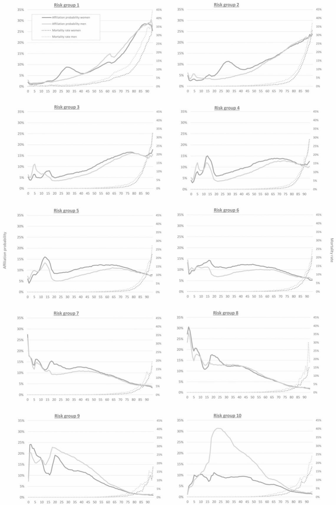
Figure 2: Average affiliation probabilities and mortality rates in the different cost-risk groups by age.