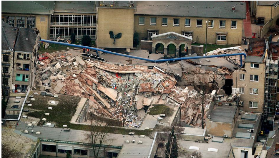
Cologne City Archive 2009