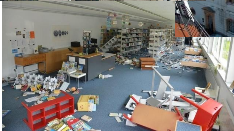
Wattenwil School Library 2017