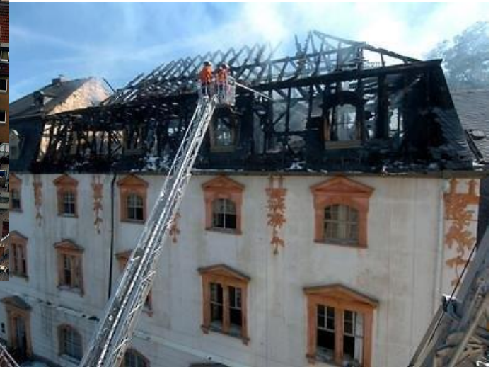
Anna Amalia Library Weimar 2004