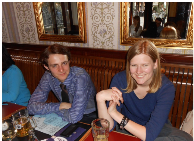
3 rd WHU round table in Duesseldorf