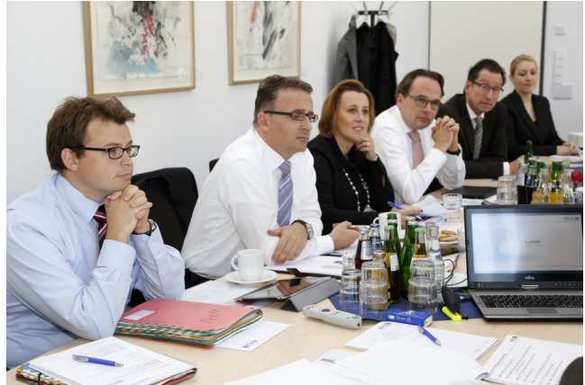
6th Advisory Board Meeting

Within the individual research projects the HCCG team works closely together with associate members from both Henkel and WHU.