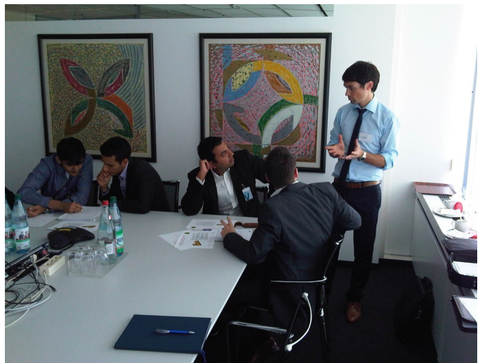
MBA participants with Henkel purchasing managers