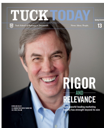
Kevin Lane Keller Tuck School of Business