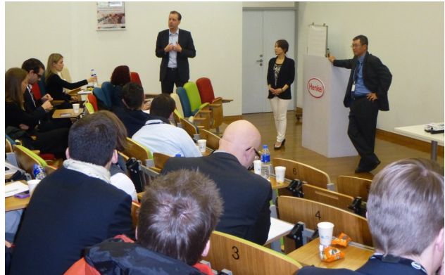
MBAs engaged in intensive discussion with Henkel APAC managers

of the Chinese economy and experience firsthand the transition of China from the “world’s work bench” to a highly competitive, R&D-driven market. The insights gained during firm visits were complemented and put in perspective through lectures at our Chinese partner universities Fudan University, SHUFE, and Tsinghua University. The academic program comprised both the particularities of the Chinese business environment, as well as cultural, political, and historical differences to Western economies.