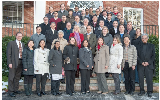
Participants GLOCOLL 2013

global purchasing leadership team in the Dueseldorf headquarters in the context of the annual “Purchasing Live” event.