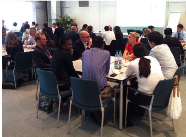
MBA participants speed networking with Henkel Purchasing Leadership team