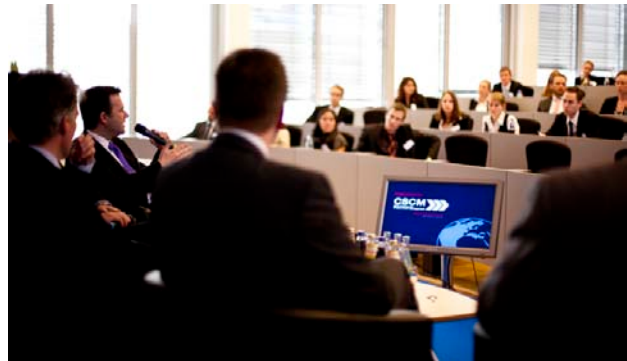
Campus for Supply Chain Management 2012