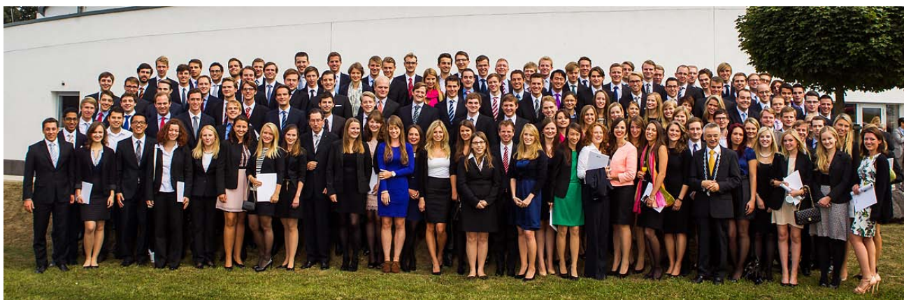
Graduation of the Bachelor of Science Class of 2012

On September 22, 2012, a university-wide graduation celebration was held for four WHU programs. This was the third such celebration. The graduates of the programs Bachelor of Science, Master of Science, and full-time MBA as well as the doctoral students received their diplomas during a festive graduation in the cultural hall in Ochtendung. The speaker for the Bachelor students was Ingrid Matthäus-Maier, former German parliament member and speaker of the KfW banking group. For the Master of Science