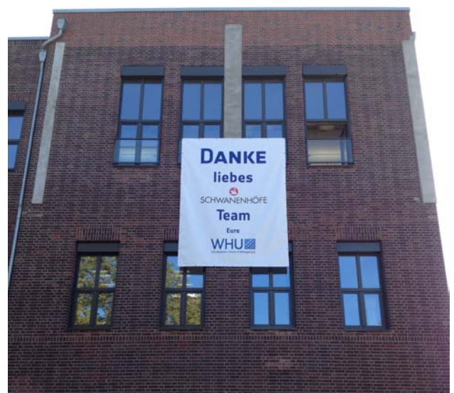
"Schwanenhöfe" in Düsseldorf

On October 19, WHU will officially open its campus in Düsseldorf, joined by representatives from academia, politics, business, and media. This will successfully bring to a close the two-year process of searching for a location and buildings, arranging for the infrastructure of the rented premises, and conceptually preparing for the activities to take place at the new location. The part-time MBA program offered by WHU in Düsseldorf since September 2010 will now also be able to enjoy WHU's own university buildings.