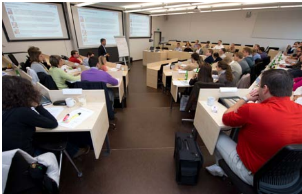
First lecture on WHU Campus Düsseldorf