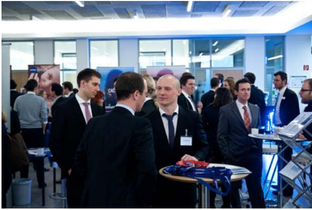
Master Your Career 2012

WHU benefactors met together in Vallendar at the invitation of the WHU Career Service. The third in a successful series of events devoted to human resources, the 2012 event focused on encouraging discussion on a wide variety of recruitment issues between business representatives, WHU Career Service members, and WHU students. What do students want out of their future careers? What do companies expect from successful applicants, and how do both sides come to a harmonious understanding? Recruiters and students gathered in small working groups to explore these issues in depth.