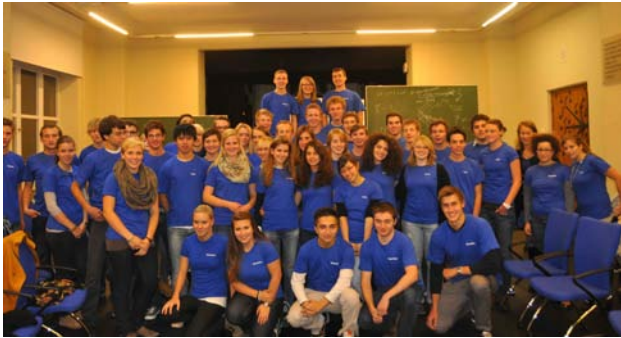
Young Student's Academy 2011

podium discussion about how employees can be motivated in social businesses. Many renowned sponsors, including the Vodafone Foundation, the Start Foundation, the Merck Finck Foundation, the IHK Koblenz, and the Frankfurter Allgemeine newspaper, supported the student academy.