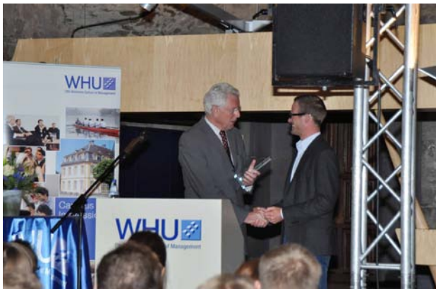
The D'Esterpreis award ceremony 2012