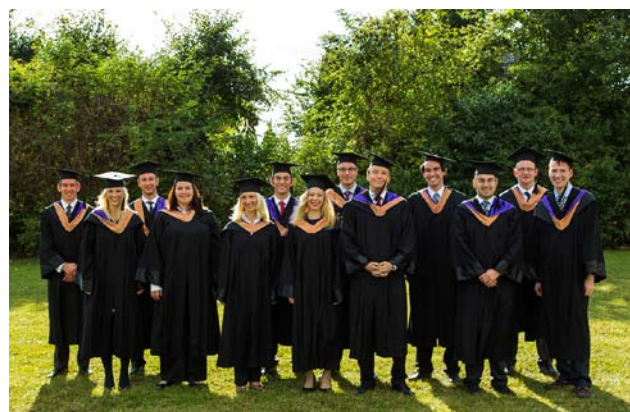
Doctoral students just having received their certificates