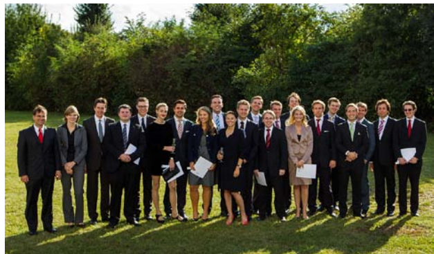
Graduation of the Master of Science Class of 2012