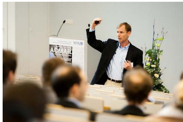
Annual Conference for Management Accounting Research (ACMAR) 2012