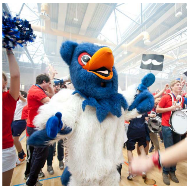
WHU Euromasters 2011