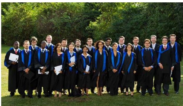
Graduation of the Full-time MBA Class of 2012