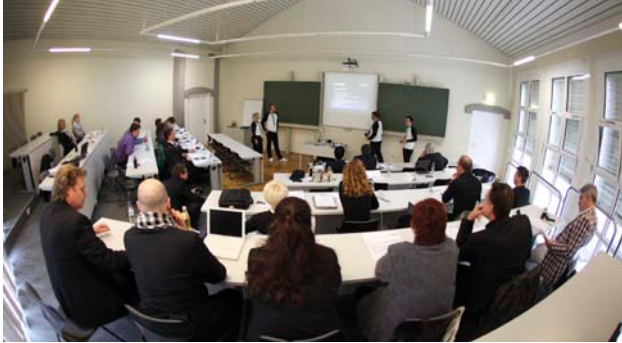
Executive Education Program

Supply Chain Management (JSCM). With this award, JSCM annually recognizes scholars whose contribution as reviewers for the journal stands out through depth in respect of content, rapport established with authors, and timeliness.