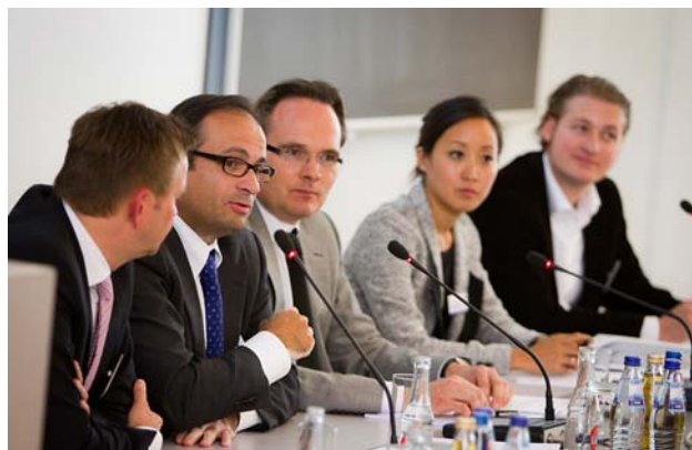
Campus for Marketing 2011