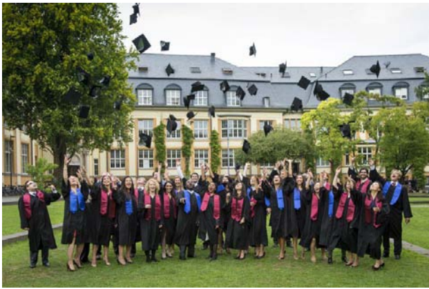
Graduation of the MLB Class of 2012

participants this year. 54 leaders began their EMBA program at WHU in September. The new class is once again characterized by a diverse combination of participants: 23 nationalities, different branches and academic backgrounds as well as diverse personal specializations define the 16 th EMBA class. The students have an average age of 36 and an average of 11 years of professional experience.