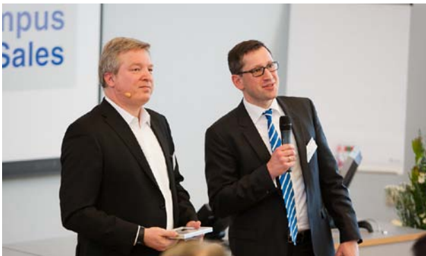
Campus for Sales 2012