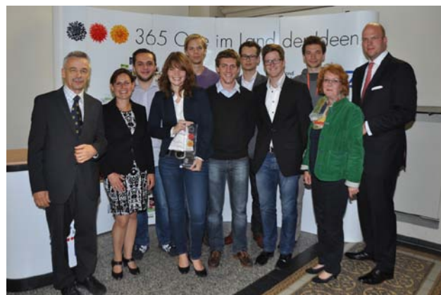
WHU First Responder after the award ceremony in Vallendar