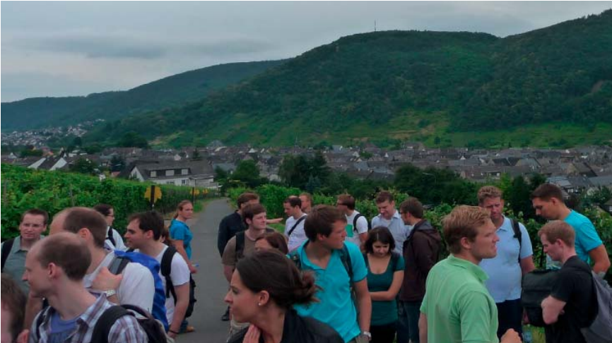
IMC summer event – Hiking in the vineyards