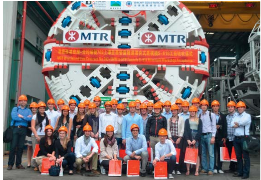
Participants of the Management Abroad Course Pearl River Delta