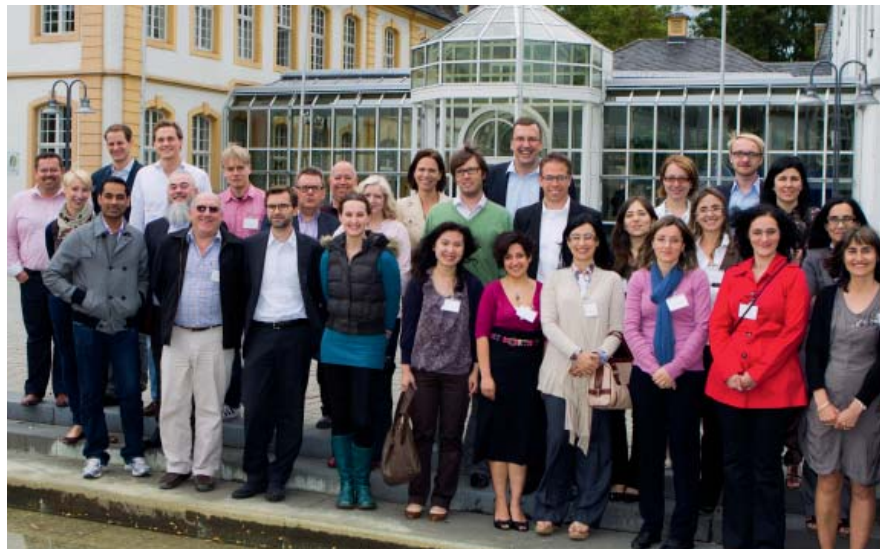
Participants of the 2nd Accounting History International Emerging Scholars' Colloquium

The closing event was a visit to the Federal Horticultural Show which was taking place in Koblenz at the time. This trip included a short tour of the fortress Ehrenbreitstein and a closing dinner in Koblenz.