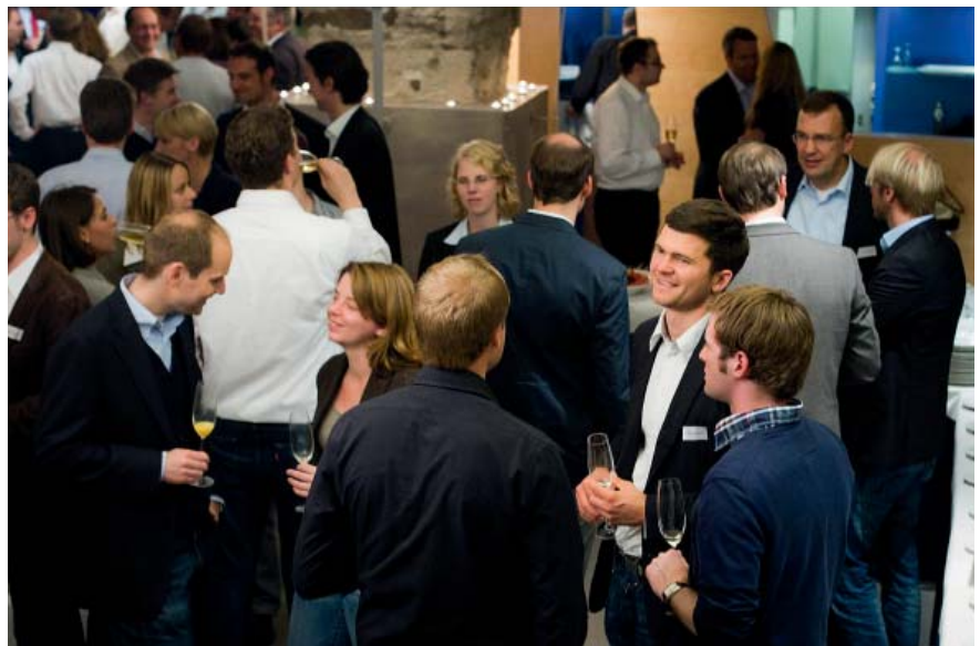
25 Years of Controlling@WHU