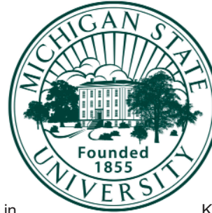
Michigan State University Seal