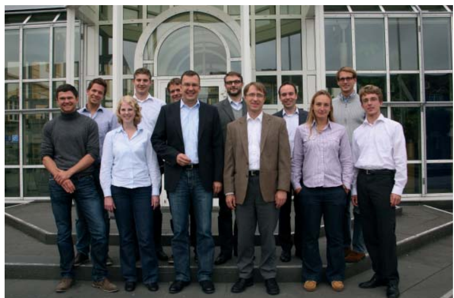
Participants of the workshop on "Upper Echelon Research"