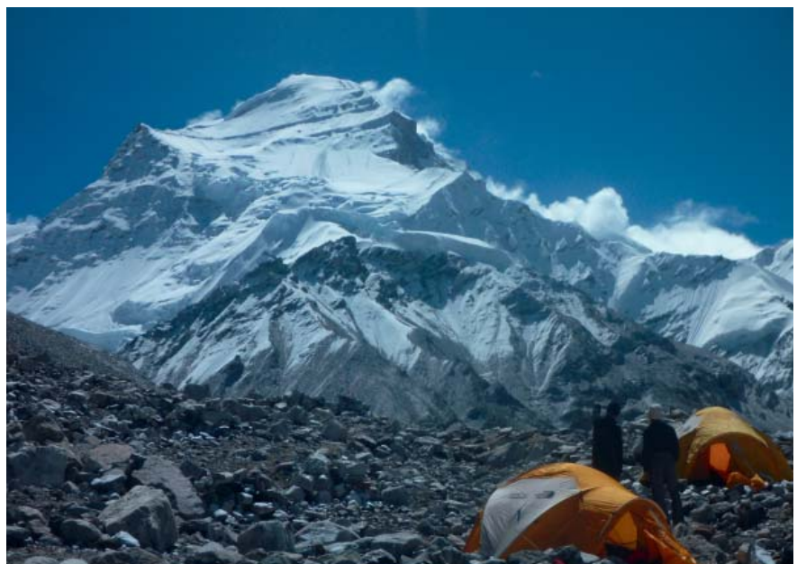
Cho Oyu – 8,201 metres

dent at the IMC, chose the extreme and went high altitude mountaineering. In a six week expedition, he set out to climb Cho Oyu, which at 8,201 meters is the sixth highest mountain in the world and located directly on the Nepalese-Tibetan border 20 km west of Mount Everest. The base camp was situated on the Tibetan side at an altitude of 5,700 meters and became home to the group for almost four weeks. From there, the group acclimatized in several climbs to higher spheres, putting up additional camps at 6,350 (C1), 6,950 (C2), and 7,550 meters (C3). After a long period of heavy snowfall, the group was finally able to make an attempt at the summit. Following a night at C3, however, the group had to give up at 7,600 meters due to extreme cold and the insuperableness of the Yellow Band, the technical crux of the mountain. Although nobody from the group reached the summit, the positive experience of amazingly cordial people, gigantic landscapes, and a personal height record clearly outweighed the disappointment of not having reached the top. The next attempt will follow for sure!