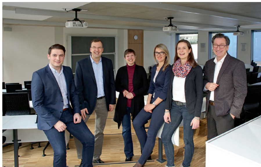
▣ The WHU Controller Panel team

Traditionally, our first study of the year focuses on the subject of salary and incentives, answering the following questions: How much do controllers earn? What are