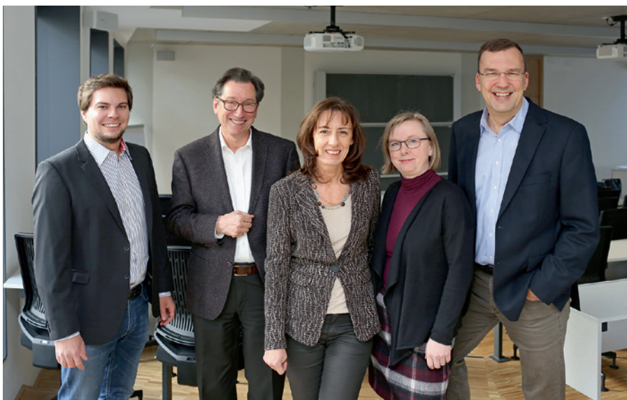
▣ The WHU Controlling & Management Review team

“Controlling & Management Review” can be accessed online on the Springer Gabler publishing house’s online platforms “Springer Professional” and “SpringerLink”. Subscribers of the print version also get free access to the journal as an e-magazine.