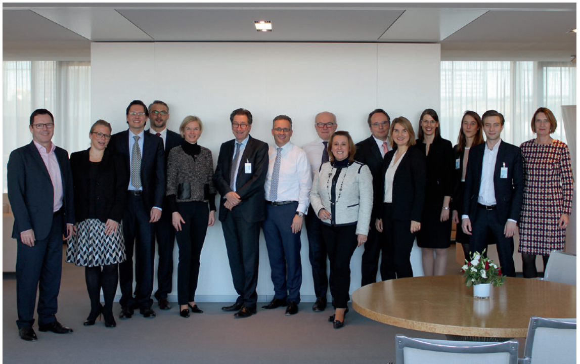
▲ Joint Henkel-WHU activities in controlling/finance: Board Meeting of the Henkel Center for Consumer Goods (HCCG)