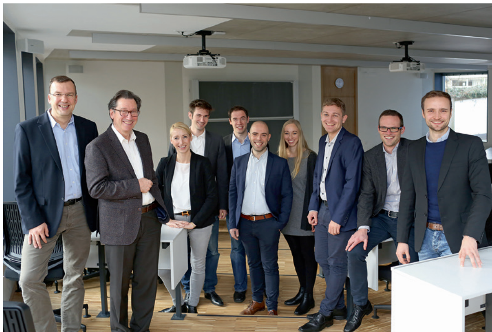
▣ The IMC's Student Affairs team