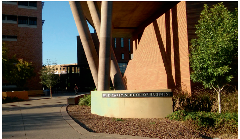
▶ W.P. Carey School of Business ▶ Universidade Nova de Lisboa

As with most accounting departments in the U.S., the researchers at W.P. Carey see themselves as “general accounting” scientists rather than specialists in a specific accounting topic. Consequently, PhD courses are oriented towards a holistic training in financial and managerial accounting, but also auditing and tax research. Moreover, research seminars are attended by all faculty members regardless of individual specialization.