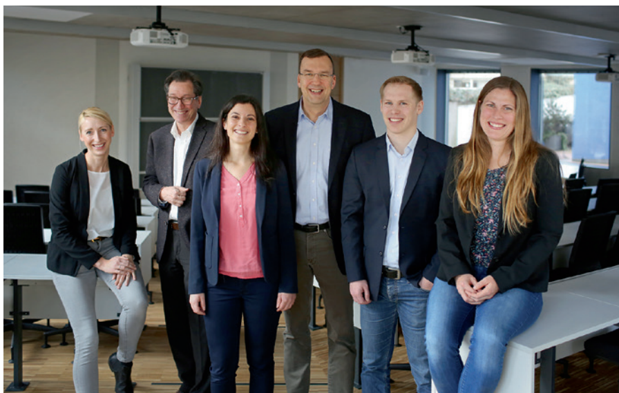
✓ The Center for Controlling & Management team

ment of both a digital business strategy and a digital data strategy; currently running industry 4.0 projects; and the use of advanced analytics in forecasting and mid-term planning.