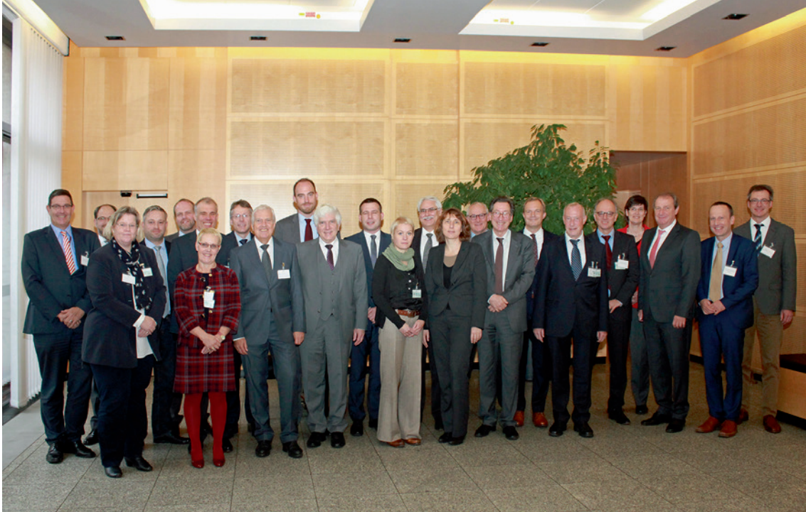
▣ Working group “Management and Control in Public Institutions”