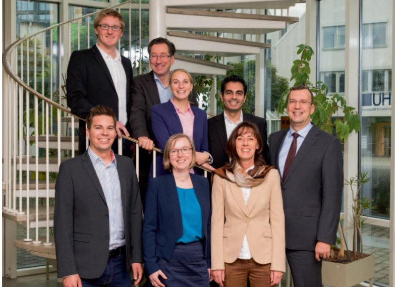
▣ The WHU Controlling & Management Review team