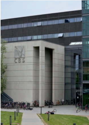
▣ Copenhagen Business School (CBS)