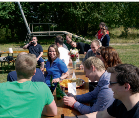
▶▶ The IMC team enjoyed the competitions and informal get-together at the IMC Summer Event.

Discussions of ongoing research and current issues at the IMC are held on a regular basis. During our monthly team days, the entire IMC team gets together for research sessions and informal meetings. While doctoral students get the chance to receive feedback on their latest work from fellow students and the IMC faculty, the regular gatherings also serve as a platform for intensive dialogue on daily working issues as well as recent developments at the Institute. It has become a much-loved tradition that two of these team days are followed by special events: the Summer Event and the Christmas Party. Each year, the IMC's rookies are responsible for organizing these events – and their colleagues have not been disappointed so far. In June, the Summer Event 2014 was held at the picnic area in Niederwerth. A team competition that tested mental and physical ability was followed by a barbecue with the entire IMC family. In December, the IMC Christmas Party was once again held at the Korova Bar in Vallendar: Again, the team members showed their competitive spirit and enjoyed a festive buffet together.