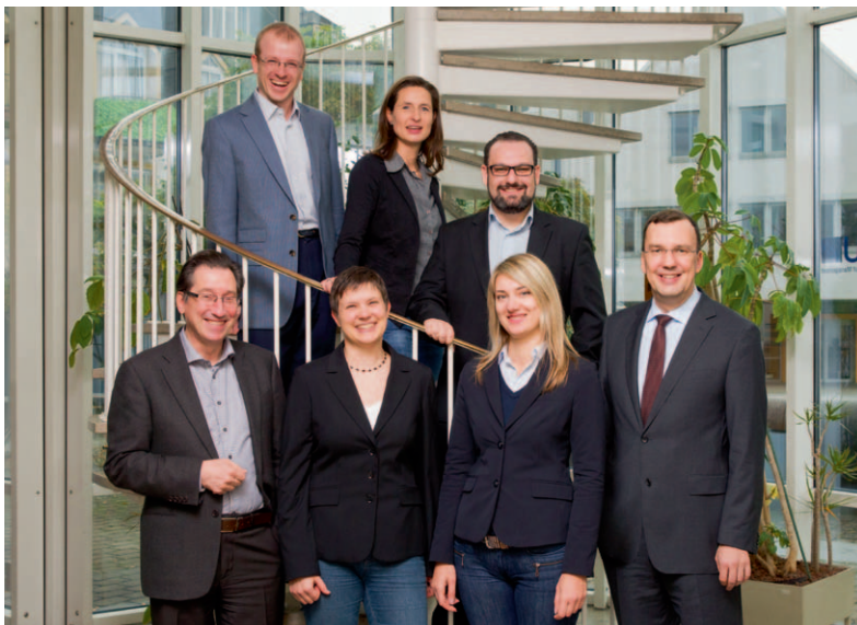
▲ The WHU Controller Panel team

How long do controllers usually work? How much do they earn? What performance targets do companies set? What are the tasks of Controlling specialists? How big is the percentage rate of controllers compared with the total workforce? How is the Controlling department positioned within the company? And what roles do controllers have to fill to be successful? The WHU Controller Panel studies provided answers