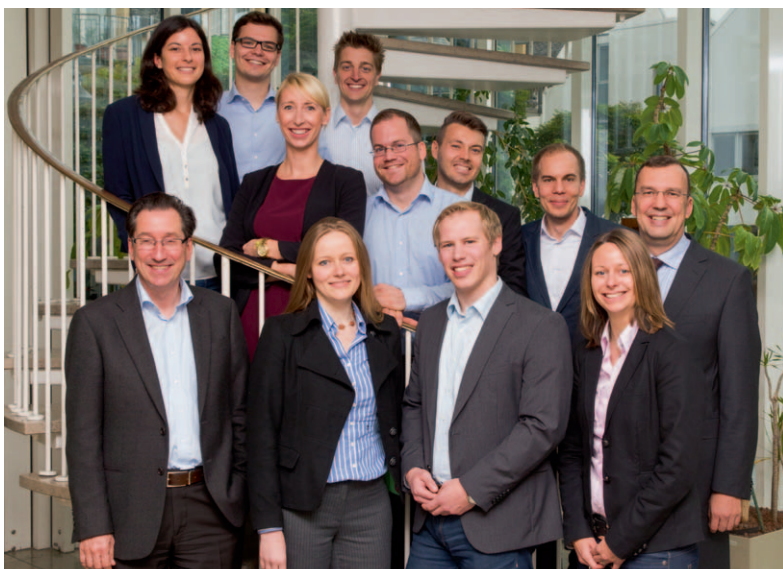
✓ The Center for Controlling & Management team

In 2014, CCM activities kicked off with a round table on the annual project "Investment Controlling" which took place at Bayer AG in Leverkusen in January. The CCM team presented the results of the CCM questionnaire and a WHU Controller Panel study on weaknesses in the investment process. In addition, two heads of Controlling shared new approaches to activities in Controlling practice: The first presentation was about a new planning process based on an innovative campus method; the second focused on a new capital allocation process. In spring, the CCM team conducted phone interviews with investment controllers and in-person interviews with the heads of Controlling of our