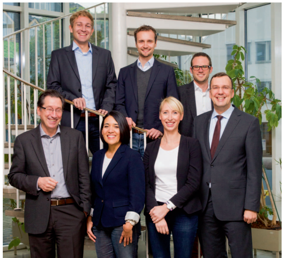
▶ The IMC's Student Affairs team