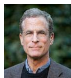
Robert Steven Kaplan Harvard Business School