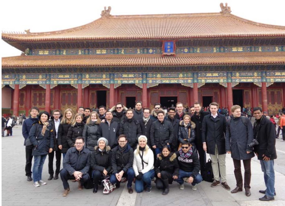
Full Time MBA Class of 2015 visiting the Forbidden City in Beijing

On the last day of the one-week module, most of the participants used the opportunity to visit the Great Wall of China north of Beijing.