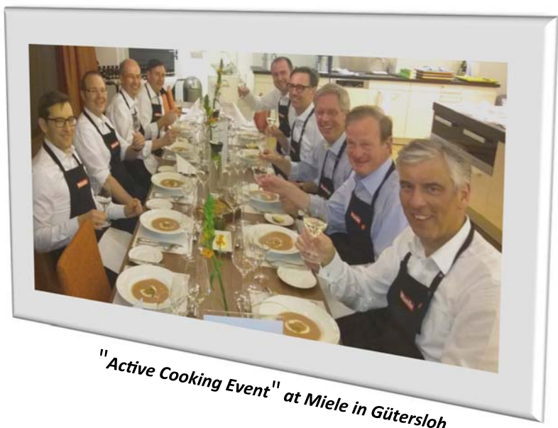
"Active Cooking Event" at Miele in Gütersloh

BASF AG, Bayer AG, BMW AG, BP Europe SE, Daimler AG, DB Mobility Logistics AG, Detecon International GmbH, Deutsche Bahn AG, energie-systeme21 AG, E.ON Climate and Renewables GmbH, Franz Haniel & Cie. GmbH, FTE Verwaltungs GmbH, H+H Senior Advisors GmbH, ThyssenKrupp AG, Jenabatteries GmbH, KION Group GmbH, Miele & Co. KG, Munich Reinsurance Comp., PUTSCH GmbH & Co. KG, Robert Bosch GmbH, Siemens AG, TRUMPF GmbH & Co. KG, Zwiesel Kristallglas AG.