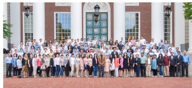
Global Colloquium on Participant-Centered Learning July 5 - 11, 2015 Harvard Business School

faculty members from leading business schools worldwide with a platform for exchanging views on innovative teaching methods and course design. In the first six-day module, the discussion focused on the changing needs of educators in various regions throughout the world, innovation in program design, teaching by using the case method, and incorporating participant-centered learning methods into conventionally-thought curricula. The second GLOCOLL module is scheduled for January 2016 and addresses the development and design of original, field-based cases.