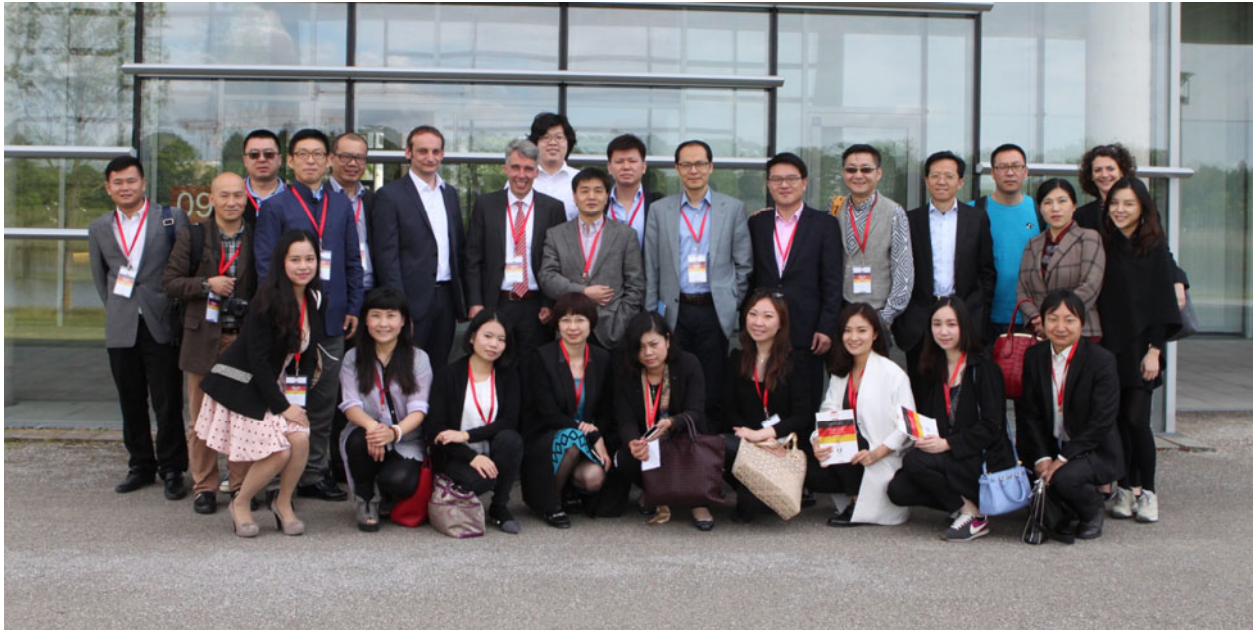
Visit of the CEIBS group at Infineon AG in Neubiberg