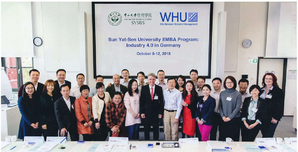
The Sun Yat-Sen EMBA group at the Düsseldorf Campus