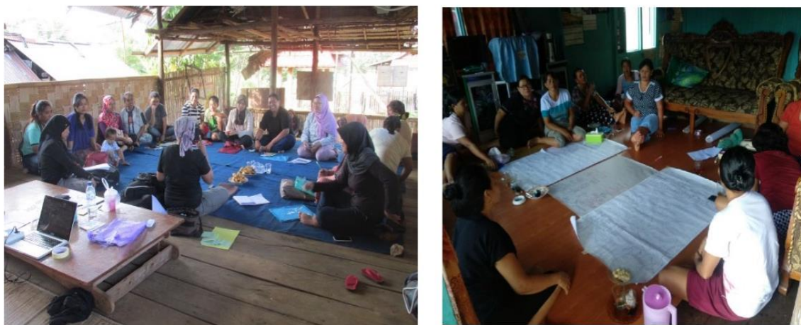
Figure 2. Applying the multiple methods of data collection. First, I used photovoice sessions for action research in Sorowako (left). Then I employed multi-sited ethnography along the Lalang River, including group discussion (right).

As a scholar-activist from the Global South, I see research as continuing the process of engagement with the communities (Swartz, 2011, pp.49-52). In order to prepare students (aged 10 to 12) in three primary schools for junior high school level, I proposed to the communities along the Lalang River to organize regular English courses. Each week from December 2019 to March 2020, I gave English classes to between 40 and 60 students, almost half of whom were girls. Before leaving the village, I organized a closing ceremony and invited parents and village officials.