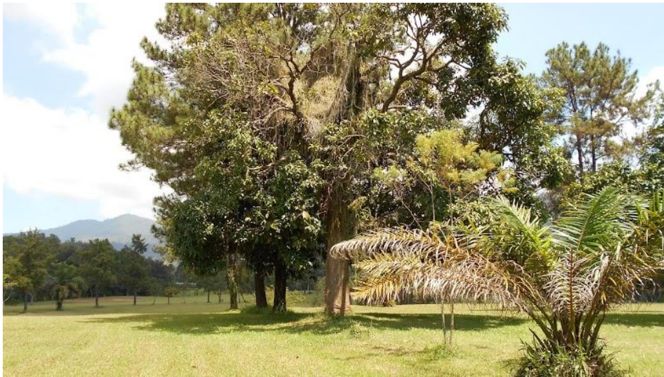
Figure 8. Kaila from the Karonsi'e Dongi community: These trees are our testimony that the Karonsi'e Dongi people were here. No one can say that the Karonsi'e Dongi people were not here. The Karonsi'e Dongi people planted these durian, mango, orange and dengen trees 70 years ago. Now our land and our trees have become Vale's golf course.

Three daughters of Karonsi'e Dongi community leaders highlighted that mining had degraded their land, making it nearly impossible for them to grow crops, and that mining is imposing restrictions on where people can farm, gather firewood and travel. Large-scale mining displaces traditional sources of livelihoods, opens up areas to new forms of employment, such as artisanal mining (Tubb, 2020) and sex work (Lahiri-Dutt, 2012) and brings new rituals and beliefs associated with making sense of the mining of mountains,