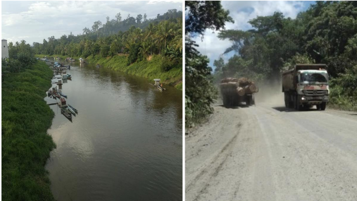
Figure 3. On the capitalist frontier of the Lalang River. Logging and coal mining are the main capitalist commodities extracted from the Lalang River, Central Kalimantan. Logging and coal trucks can be seen side by side on the main road along the Lalang River. Riverine ethnic identities configured by living with rivers have changed since the road was built, and rivers became used for the transportation of logging and coal.

The dual economy initiated a process of capital accumulation, with the expansion of the family rubber plantations and land acquisition driving the transition to a disciplined wage labour economy. This process was accelerated when logging companies arrived in the 1970s, followed by coal mining in the 2000s. As the capitalist frontier advanced, it moulded the process and the place (Tsing, 2003, p.5102). Logging and coal mining provided jobs mainly for men. The role of women was restricted to providing unpaid labour to sustain the extractive economy. This further integrated the Murung into the capitalist economy and gave rise to a new economic model: subsistence agriculture plus the family rubber plantation plus employment in logging or mining. However, the logging industry collapsed in the late 1990s.