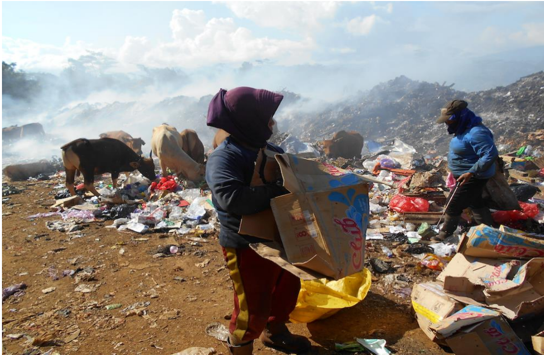
Figure 5. Collecting garbage for survival and resistance. Zaskia, a Karonsi'e Dongi woman, is collecting the litter in the Vale domestic waste dump in Sorowako. She lives in the waste rock disposal area that the company has transformed into a camping ground. In the past, it was the community garden before being taken over by the company.

Many women work at the dump. My situation is better than my friend's. She is a widow and has five children. She looks for rice dumped by the [mine] workers to recook into porridge. Sometimes we get fish, we wash it and recook it. This is a hard way to make a living, but it is better than stealing or begging. But we must come here early before the dump trucks, or else we must scramble away with the cows. (Glynn & Maimunah, 2021, p.15)