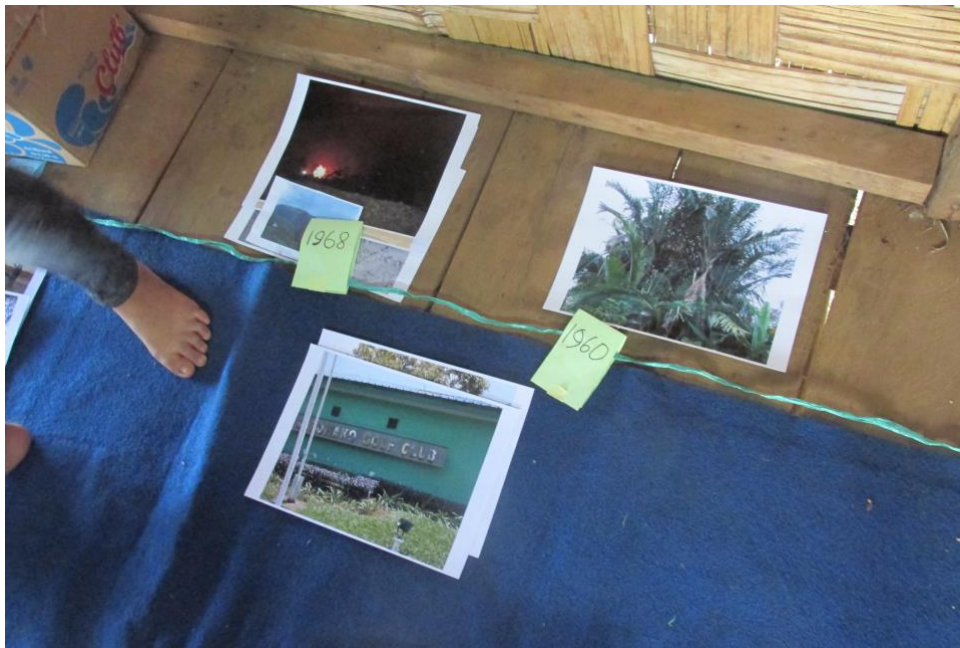
Figure 6. Photovoice participants 'naming the moment'. In their photo-stories at the convergence to conduct a conjunctural analysis of the photo-stories.

gathered from interviews, participant observations and the conjunctural exercise in our analysis of the themes.