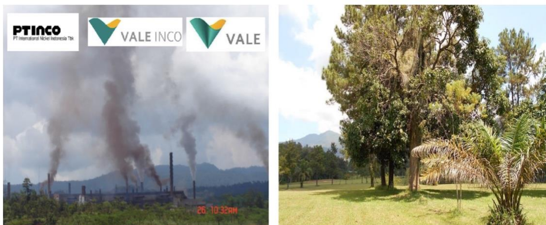
Figure 4. Land transformation in Sorowako. Sorowako customary lands became a mining town (left) ; the Karonsi'e Dongi's agricultural land, including the fruit gardens, was converted to a golf course.

community's history of dependency on mining and experience precarious employment as labourers at the mine. The weak local government and the political-military strength of the Soeharto regime resulted in rumours of money to be made from land compensation payments, weakening ethnic solidarity (Tyson, 2010 p.110). A series of land compensation payments, sometimes called "charity contributions", negotiated under pressure from the government, local elites, politicians, and security forces, divided the community and made the disputes an enduring arena of identity contestation, but ended up leaving the community dissatisfied. When President Soeharto fell, decentralization, creation of new districts, and the revival of adat customary law reopened land disputes with Inco nickel company. The company also makes use of ethnic identity issues for its own purposes by choosing particular indigenous organizations to manage community development funds. This gives great power to these organizations, who use the funds for education improvement programs, developing work skills for indigenous peoples, cultural development, electricity procurement, and pilgrimages to Mekkah.