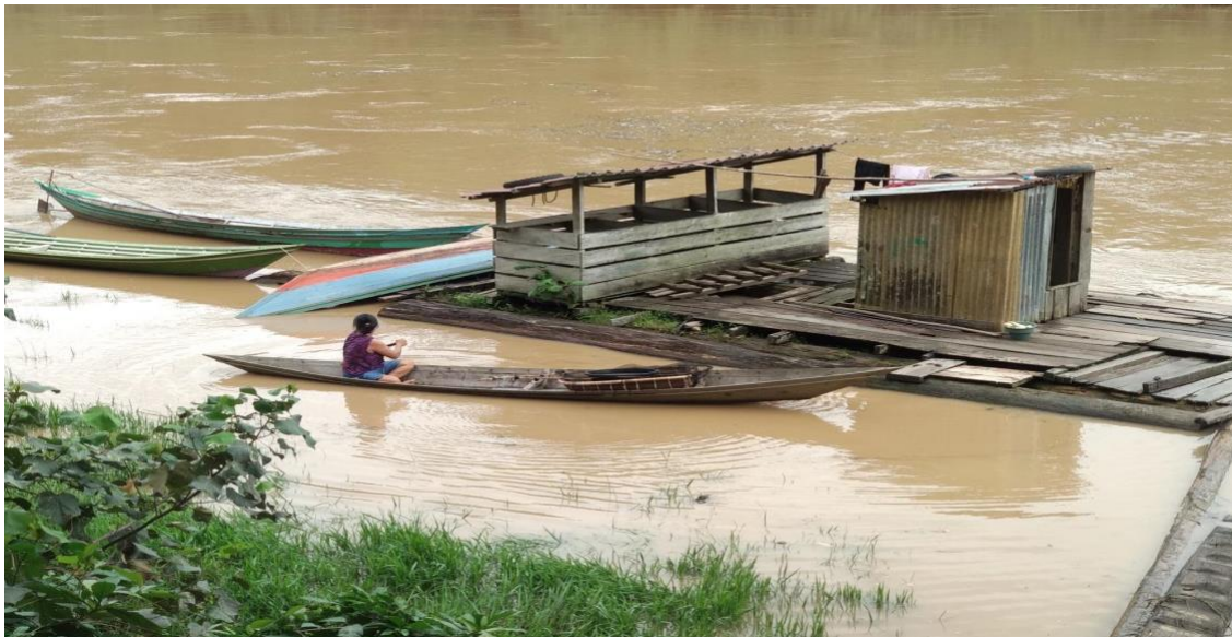
Figure 11 A lanting on the Lalang River