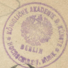
Fig. Lib. B. No 3865 A.