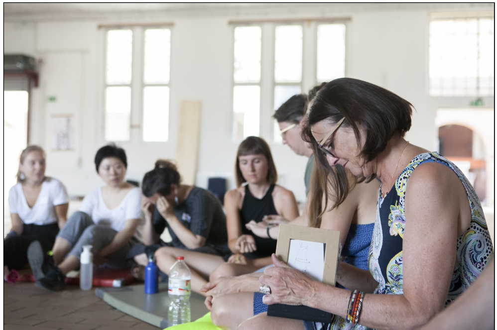
Abb. 3. Club of Im_Possibilities. Teilnehmende macht Notizen. Weitere Teilnehmende (Hintergrund) geben das Rosenöl weiter