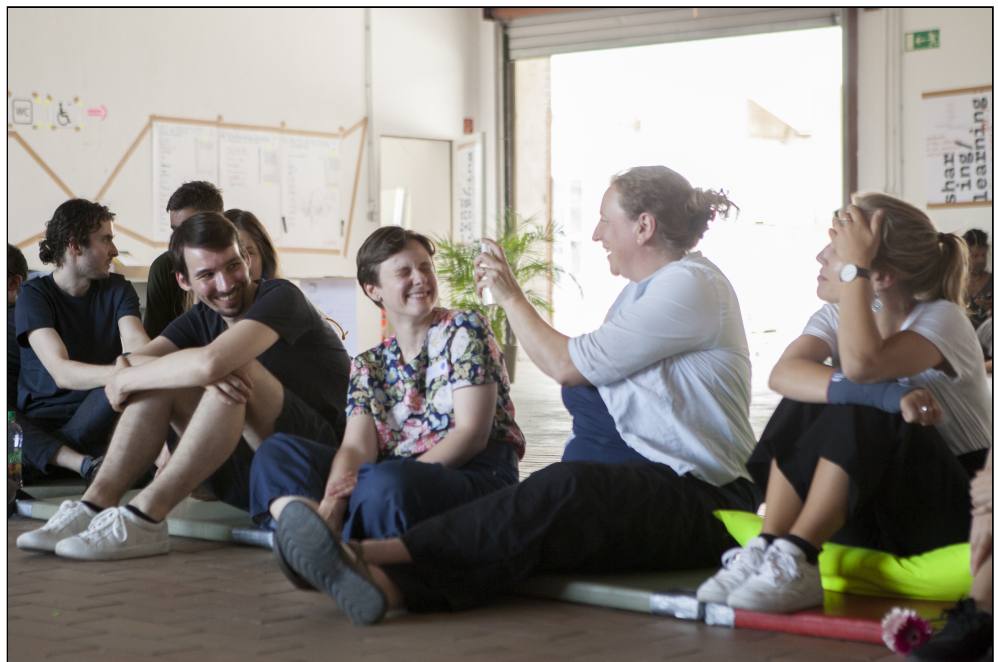
Abb. 2. Club of Im_Possibilities . Teilnehmende geben Wasser weiter