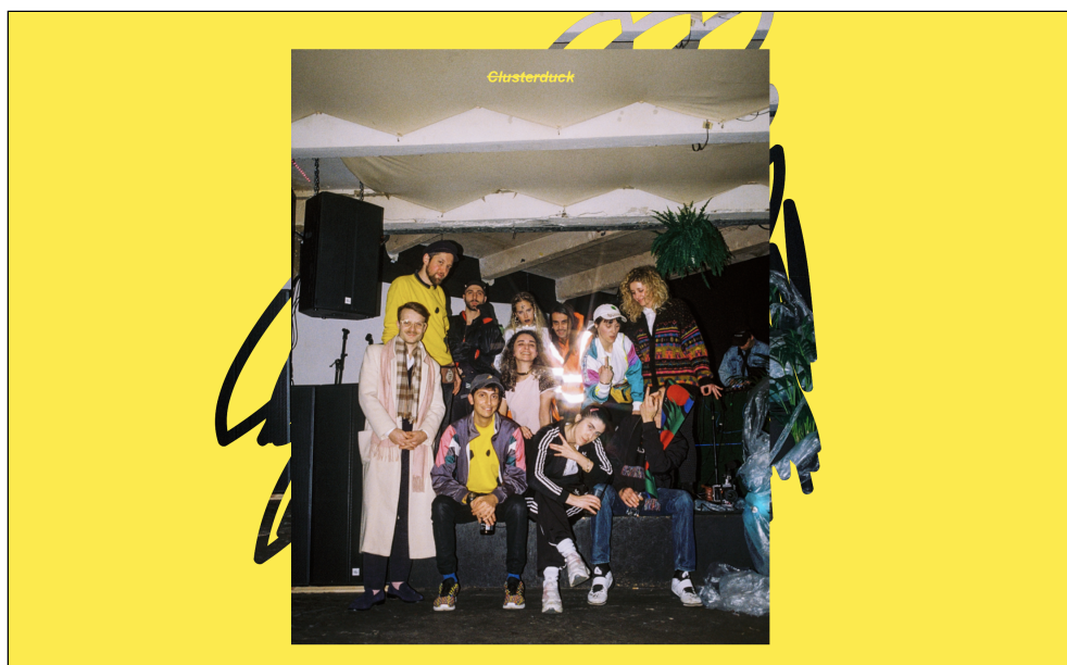
Fig. 1. Portrait of Clusterduck Collective taken at Panke.Gallery in 2017, excerpt from the Internet Fame catalogue

What are the reasons behind a newfound popularity of collectives within art economies? Could it be that collective practices are a necessary answer to the challenges faced by (creative) workers in late capitalist society? To reflect these questions, we take this text as a starting point to try to critically assess our own personal history as an internet-based research collective.