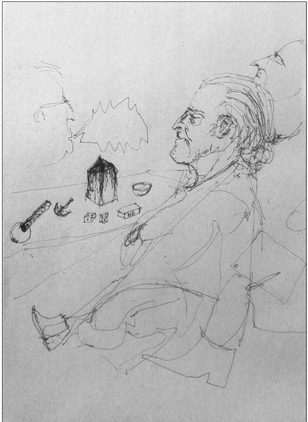
Fig. 3 Maxim Bauer: zeichnerische Dokumentation (drawn documentation), 2017. Pencil on paper. © Maxim Bauer