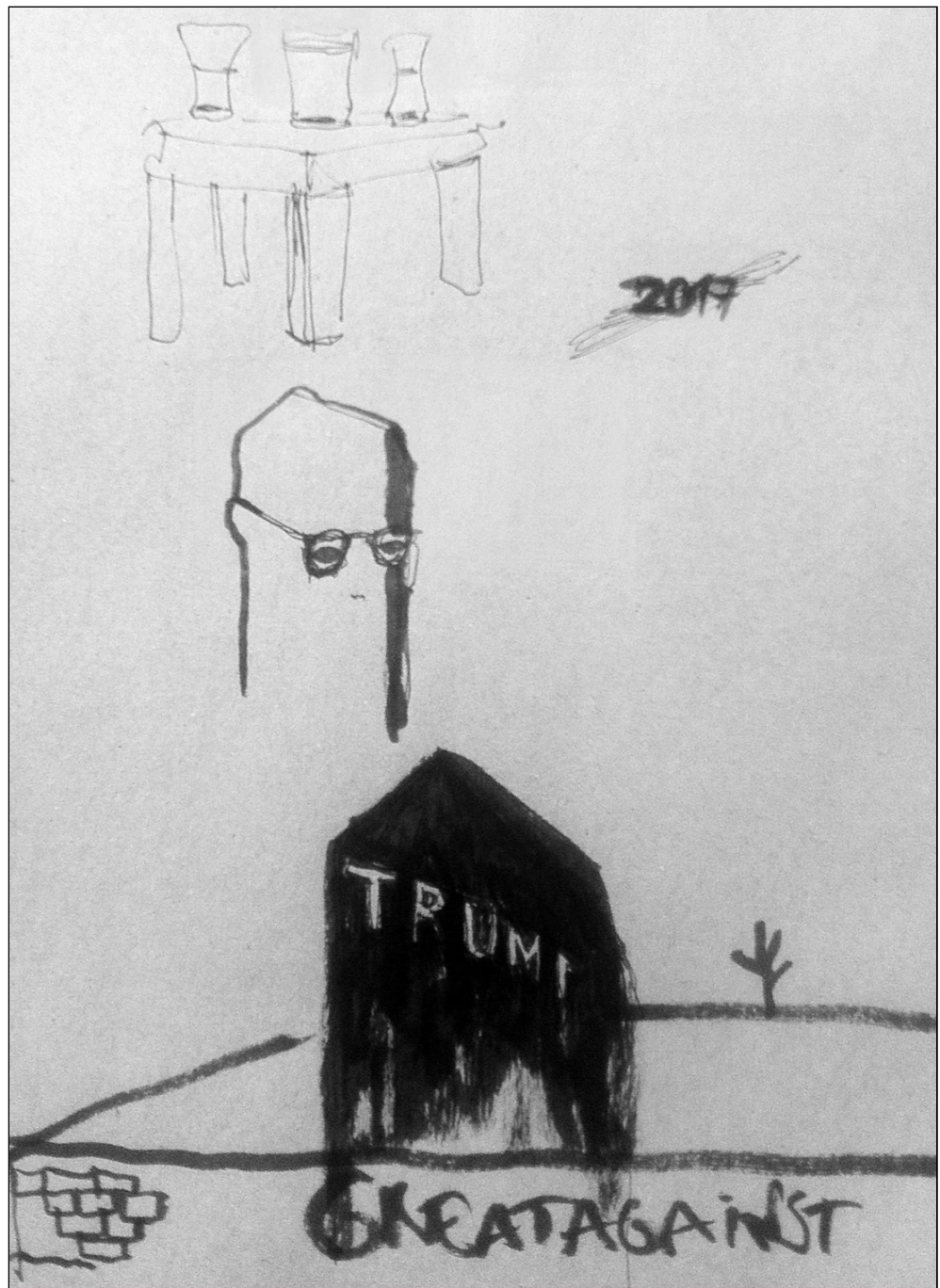
Fig. 4 Maxim Bauer: zeichnerische Dokumentation (drawn documentation), 2017. Pencil on paper. © Maxim Bauer

On a more general level, this brings up the question of responsibility and ethics. A word that keeps crossing my mind when thinking about the films, is “faith.” This is not a very scholarly term, and I have not yet come to a conclusion what my mind wants to tell me with this association. In fact, it makes me feel more comfortable to rephrase it slightly and speak of “trust.” It seems to me that John Smith’s films rely on a contract that implies a basic assumption: We do take the images of The Black Tower as actual images of actual locations in London at an actual point in time in the 1980s. If we had reasons to question the image on this level and to think of it as fabricated, non-representational, “fictional,” the film would be quite pointless.