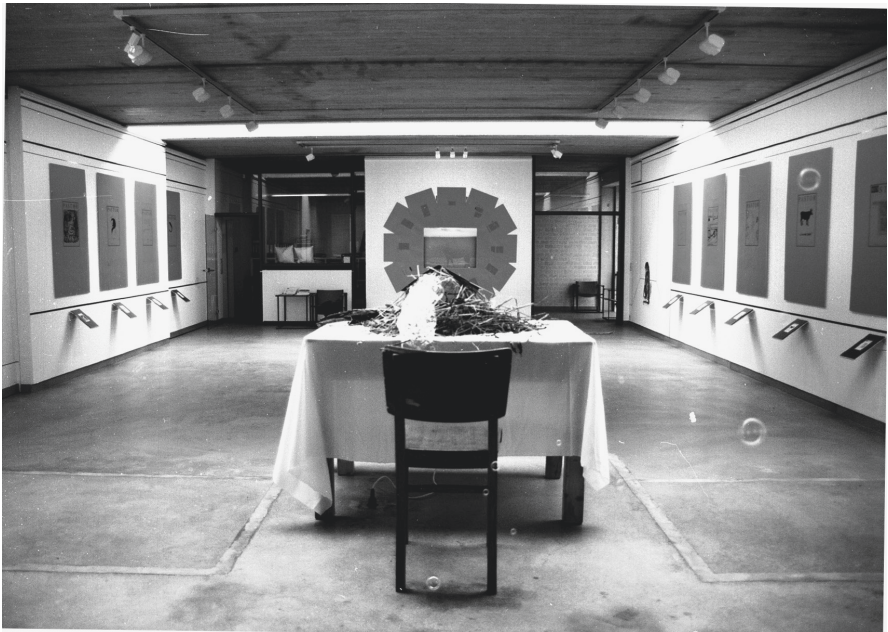
fig. 4: Vadim Zakharov: The Provincial Bubbles of Cologne Pastor , 1992, installation display, Deweer Art Gallery, Otegem, 1992.