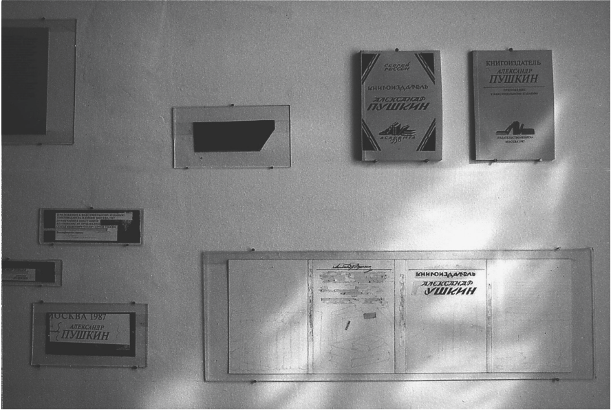
fig. 3: Vadim Zakharov: Alexander Pushkin the Book Publisher , 1992, installation display, Gallery "L", Moscow, 1992.