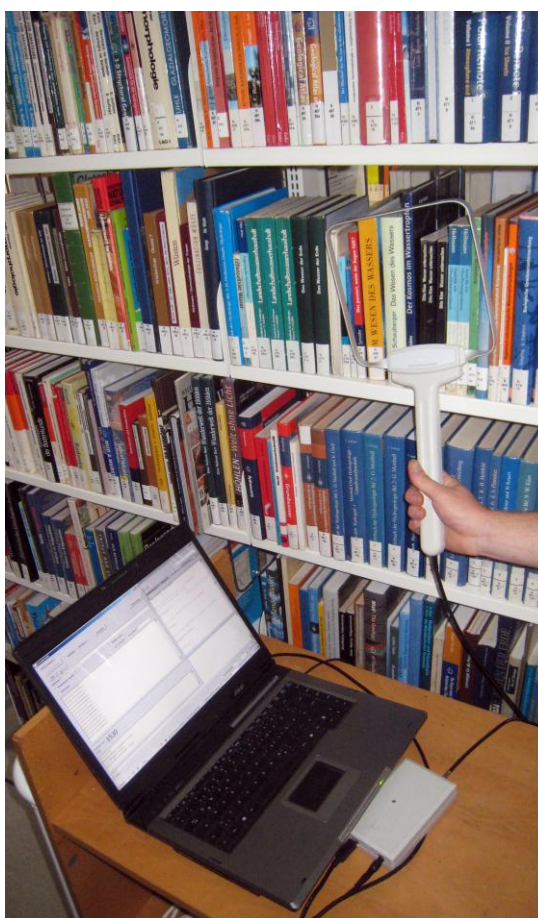
Figure 1 Example of an inventory setting

In the year 2008 colleagues of our library compared two RFID mobile-devices (provided by the German company FEIG) to manage an inventory from the same company. Correspondent to the Danish data model (ISO 28560-3:2011) the reader read the accession number as reference information of each copy or multimedia package. Both devices attained the same results in the detection rate. We went along the book-spine in the shelf with a speed of one metre in five seconds and reached detection rates of almost 95 percent. But these results fluctuated by an average of 60 to 80 percent as detection rate and could not be stabilized. So we decided in that year to manage our stocktaking by the classical way to compare printed lists of non-borrowed media with its existence amid the shelves. It was the first stocktaking since the foundation of our Technical University of Applied Sciences. For all this procedures we required half a year and got the information of 920 missing items.