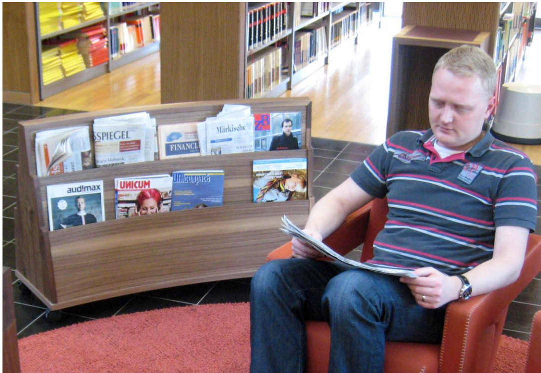
Figure 3 The described wood shelf for journals