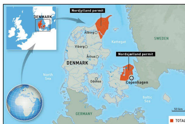
Figure 3: Danish licenses of Total Group (2013).

Total is the only company that currently holds licenses in Denmark for shale gas development purposes, at the Northern tip of mainland Denmark and on the Nordsjælland island South of the Kattegat and West of the Danish Straits. Total has stated that there might be about five times as much shale gas onshore as the country has produced from the North Sea fields. Chances of finding commercially interesting quantities have been estimated to be about 20 percent. If exploration proves a success, production might start in 2020 (Total Group, 2013c). Total's license areas are mapped in figure 3.