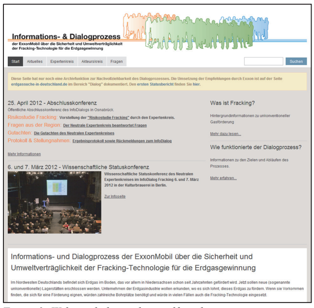
Figure 3: Website dialog-erdgasundfrac.de

The firm documented the whole process and had its representatives present it at various events. But it framed it, as could be expected, in all-positive terms. News media generally reported in a friendly way, particularly local and regional newspapers and broadcasting. But since all was public, many critical voices echoed across media and the Internet. For example, since ExxonMobil paid for the complex and costly procedure, questions came up how independent the work of the panel of nearly 40 scientist really was and whether Exxon influenced them, perhaps indirectly. Experts and the company did not disclose how much the scientists and their reviewers were paid. So this left room for speculation. Beyond such details, some of course put a question mark behind the intentions and purposes of the total exercise.