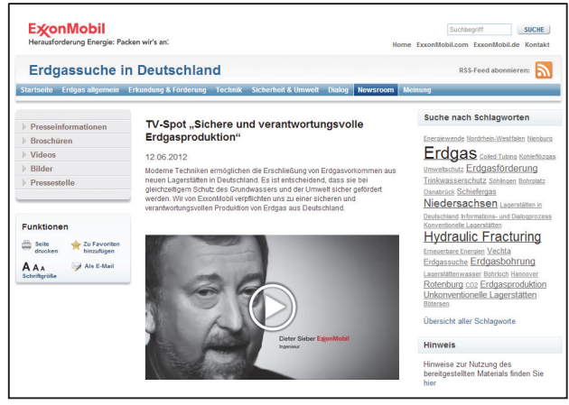
Figure 2: Samples of German ExxonMobil media – brochure covers and TV spot with employee testimonial on a special-interest website, erdgassuche-in-deutschland.de

The company has coined clever slogans, used in various media and in press interviews, such as "Germany needs natural gas, and Germany has natural gas." The message is simple but effective — we have it, so let's go get it (ExxonMobil Central Europe Holding GmbH, n.d.-a; von Petersdorff, 2013).