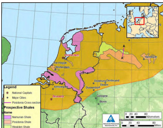
Figure 1: Principal shale gas basins in Western Europe (U.S. Energy Information Administration, 2011).