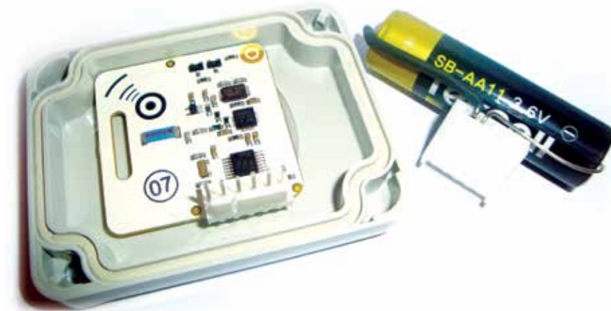
Fig. 2) An OpenBeacon tag pasted in a case

firmware supports many functions for saving energy, changing the battery always means a lot of work. That is why there are plans to support the energy delivery by installing solar cells on the tags case in the near future.