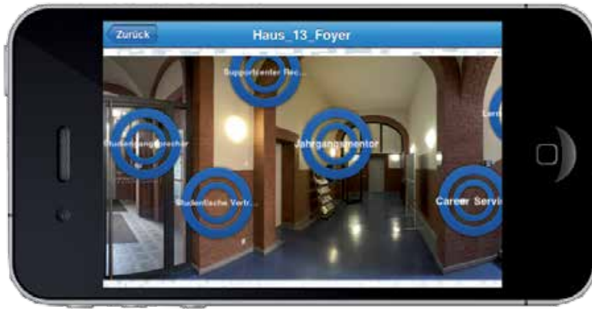
Fig. 1) iCampus iPod Application

Bitmanufaktur GmbH (Bitmanufaktur GmbH (2012)) and the software provided by the OpenBeacon project (OpenBeacon (2012)).