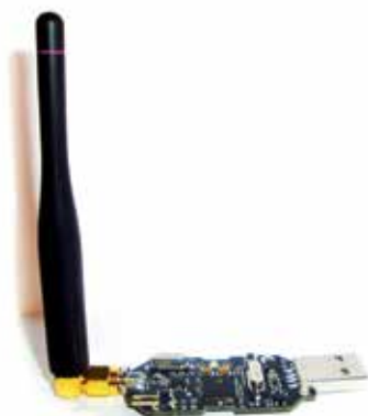
Fig. 3) The OpenBeacon USB1

The EasyReader can be seen as a further development of the AC Wi-Fi Station, whose power supply comes via Ethernet (PoE). In addition, it receives data with 2 antennas to avoid the loss of