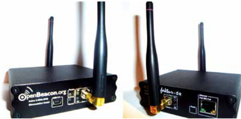
Fig. 5) The OpenBeacon Easy Reader

packages due to local cancellations in the 2.4GHz band. Received RFID packages are forwarded across the Ethernet port of the EasyReader. Next to these hardware features the reader is configurable and flashable via a mini USB port. Furthermore, it offers a statistic mode, where users can see package transfer rates and more. Using a filtering algorithm, the implemented firmware automatically handles the double-signal reception. (OpenBeacon (2012))