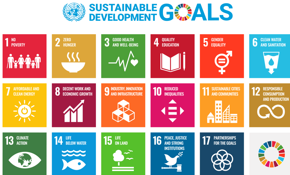
Figure I: Sustainable Development Goals