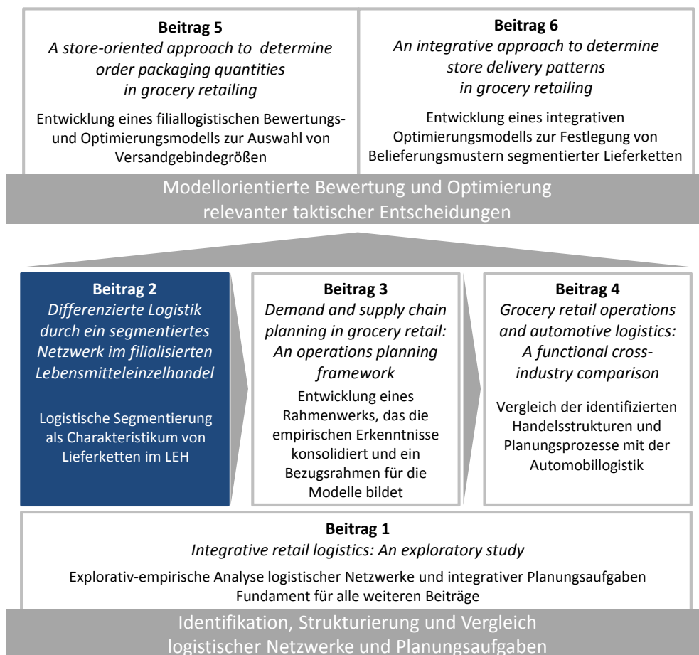
Abbildung 3.1: Einordnung des Beitrages “Differenzierte Logistik durch ein segmentiertes Netzwerk im filialisierten Lebensmitteleinzelhandel”