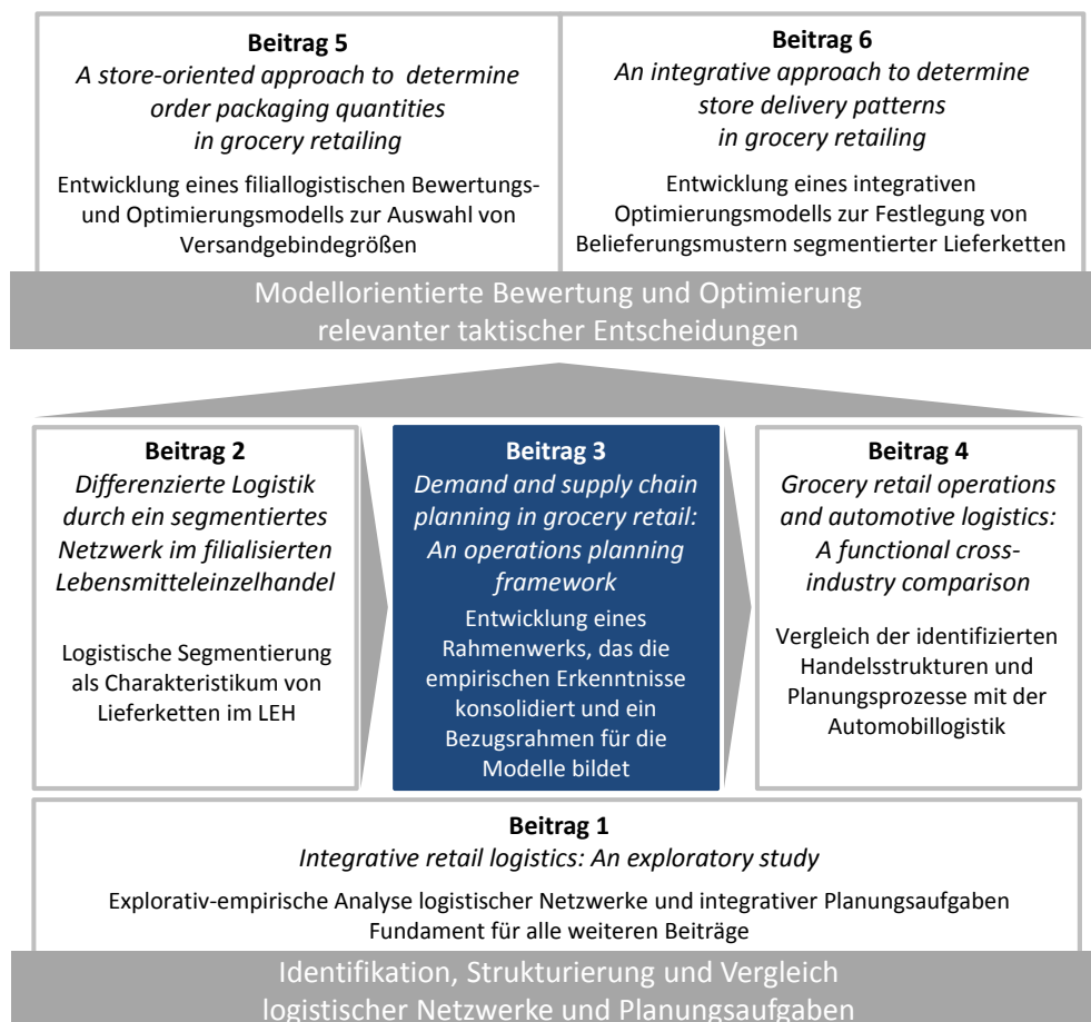
Abbildung 4.1: Einordnung des Beitrages “Demand and supply chain planning in grocery retail: an operations planning framework”