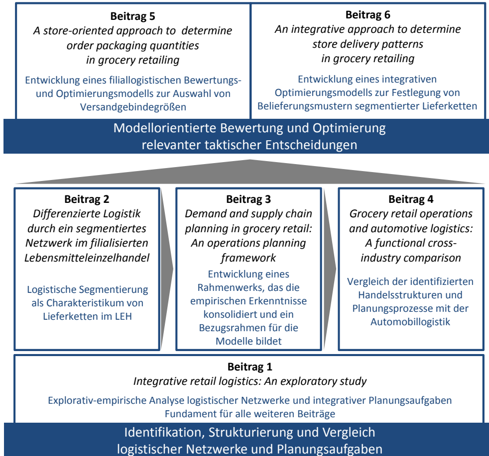
Abbildung 1.1: Thematischer Zusammenhang der Einzelbeiträge

Abbildung 1.1 illustriert den thematischen Zusammenhang der Einzelbeiträge. Der erste Beitrag “Integrative retail logistics: An exploratory study” bildet ein explorativ-empirisches Fundament, auf dem alle weiteren Beiträge aufsetzen. Die Durchführung und Analyse von 28 leitfadengestützten Interviews liefert eine Vielzahl von relevanten Erkenntnissen über logistische Netzwerkstrukturen und integrative Planungsprobleme im LEH, die in die weiteren Beiträge einfließen und auf deren Basis die Optimierungsansätze entwickelt werden. Ein spezifisches Charakteristikum von Lieferketten im LEH ist die horizontale Segmentierung der Warenströme nach unterschiedlichen Dimensionen und Kriterien oder Kombinationen von Kriterien. Der zweite Beitrag liefert basierend auf den empirischen Ergebnissen eine tiefgehende Beschreibung des Segmentierungsansatzes im LEH und der damit verbundenen Planungs- und Entscheidungsprozesse sowie deren Zusammenhang mit der logistischen Effizienz in den Teilsystemen der Lieferkette.