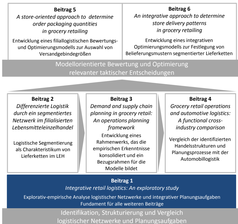
Abbildung 2.1: Einordnung des Beitrages “Integrative retail logistics: An exploratory study”