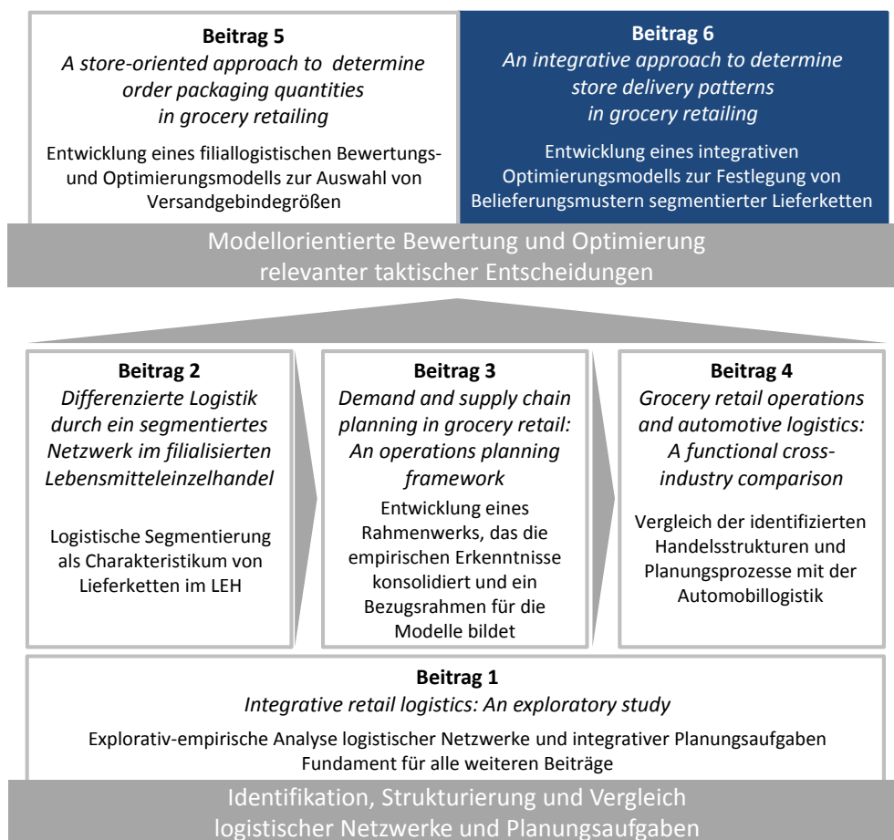
Abbildung 7.1: Einordnung des Beitrages “An integrative approach to determine store delivery patterns in grocery retailing”