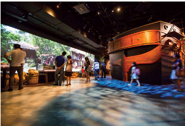
image 2 Singapore History Gallery, 2015

While this generated interest and appeal at one end of the museum's visitor spectrum, it also elicited questions about the relevance of such exhibitions. This issue was not resolved, and after the shift in Singapore's political-social landscape following the 2011 general elections, it was subsumed in a developing "Singapore 50 narrative," a collaboration between state and citizenry to foster a national narrative of the half-century following Singapore's independence.