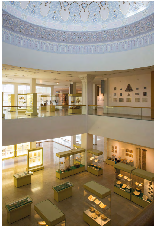
Image 2 View of the permanent display with no artificial boundaries or partitions between galleries

through the use of architectural models of mosques. This gallery becomes a background history of Islamic art and architectural development, and highlights the important decorative features such as ceramic, wood, marble, and metal elements, which will be displayed on a different level of the museum. In the hierarchy of space, the next gallery is the Quran and manuscript gallery. This is actually the first gallery to display historical artifacts, as the rest of the permanent galleries do as well. Yet, following the historical introduction, this is the most important gallery, as it presents the history of Islam through a collection of Quran manuscripts and scholarly manuscripts from around the world. The gallery also houses the oldest artifact in the museum: a vellum leaf in the Hijazi script style, from the Hejaz in the first century of Islam.