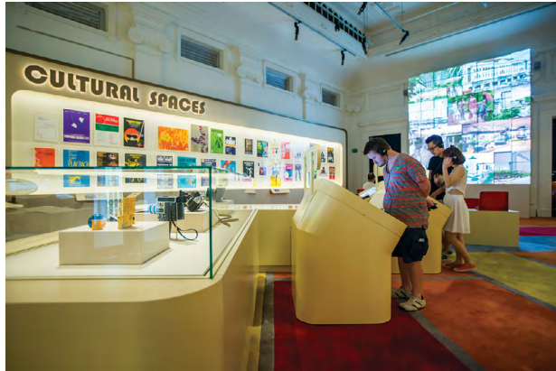
image 3 Voices of Singapore Gallery, 2015

eration – in fact, the translation costs were provided by the Singapore Tourism Board. The language selection was hence based on the fact that Singapore welcomes a large number of Chinese, Indonesian, and Japanese tourists annually. Following feedback from the Indian community in Singapore, the museum also sought to be more inclusive by providing some Tamil content in its galleries.