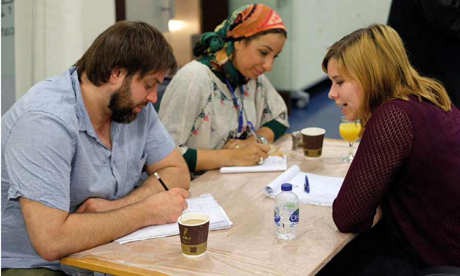
image 4 Participants in discussion during an expert meeting

important goods in the world, and raising children, the subject of the poem, is also a universal theme. Both contain emotions such as love, fear, or uncertainty, which both groups used for their exhibitions in order to establish an intercultural approach and add perspectives they might have omitted if working in a non-international team. Also worth mentioning is that every team conceived of points in the exhibitions where visitors could voice their views and experiences. This approach helps prevent showing only the curator's views in an exhibition and expresses that the visitor's opinion is just as important as that of the curator.