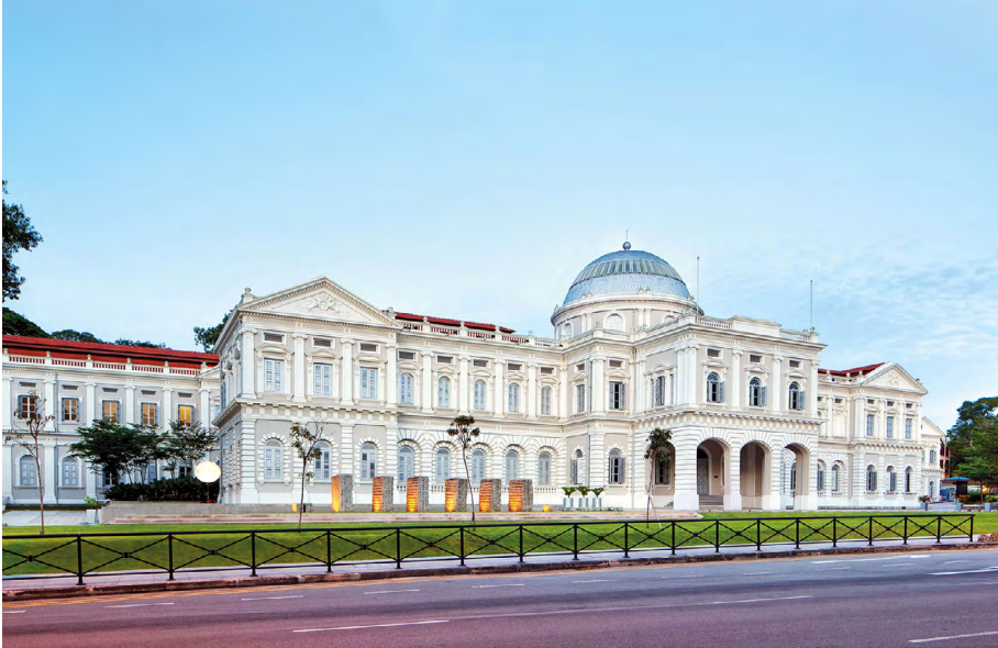
image 1 National Museum of Singapore, 2017