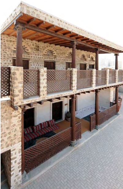
image 6 Bait Al Naboodah, two-story building

create a strategic goal (“the big idea”), and discuss the methods required to attain this goal.