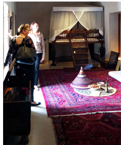
image 2 Photograph of the reconstructed room