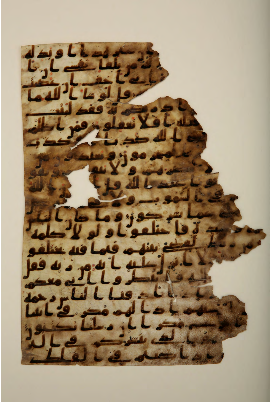
Image 3 Quran leaf. Written in Hijazi script on vellum. Near East or Arabian Peninsula. 7th-8th century AD/1st-2nd century AH