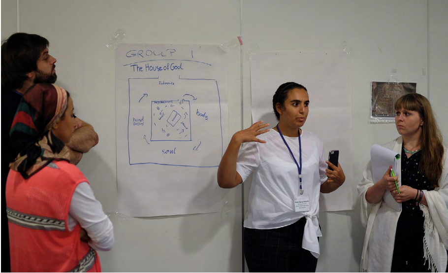
image 3 Participants presenting their results from the exercise “Shared Authorship in Curating”

most interesting because it best demonstrates the advantages of intercultural communication and intercultural curation.