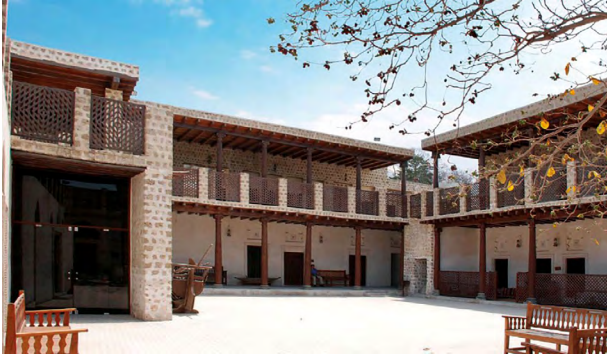
image 5 Bait Al Naboodah, view of the inner courtyard