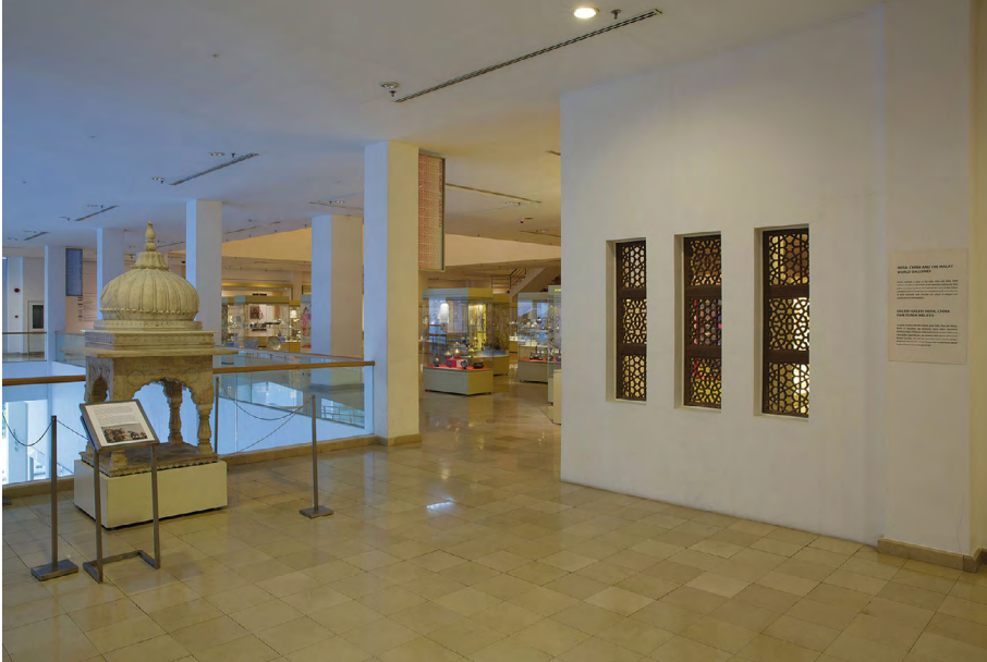
Image 4 Entrance to the India, China and Malay world galleries

Keeping the “hierarchy” as a priority in mind, the next three galleries are dedicated to the three ethnicities in Malaysia: the Malay, Chinese, and Indian Islamic legacies. Museum space “can be used to stage displays and narratives” (Zamani and Peponis 2010, 876). Thus, in creating an interrelationship among these three connected galleries, the conceptual hierarchical system became fundamental in portraying each gallery’s connection to the visitors. By assessing the important legacies of the multicultural society that the museum is part of, the institution sends a keen message that it is an integral part of this society. In this manner, the museum evolves from the traditionally rigid thematic, dynastic, or chronological gallery division toward a more dialogue-based horizon. The second level of permanent galleries follows a thematic approach more inclined toward material typology.