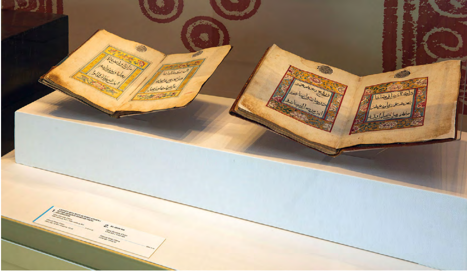
Image 7 Artifact with caption on display at the gallery