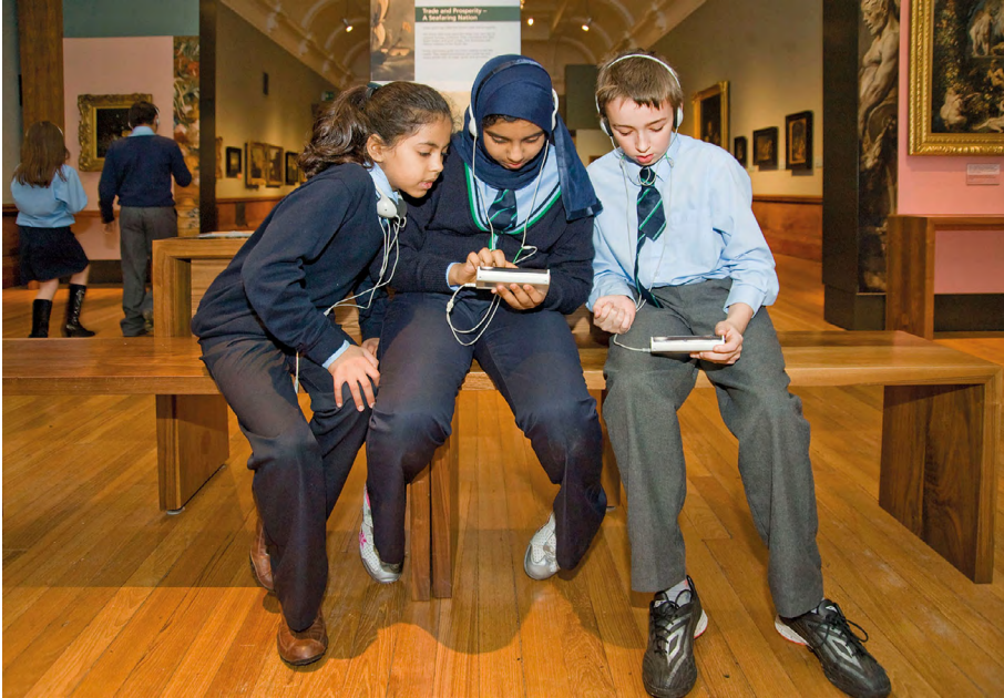
Young people participating in the award-winning “TCoNE” program at Kelvingrove, which communicates using values important to the visitor.

This reflects the egalitarian traditions and principles of the city, whereby everybody (within a group of people) is treated equally. In Glasgow, our social inclusion ideas are embedded into our identity. Glasgow Life plays a key role in making Glasgow a city where all citizens, regardless of ethnicity, religion, social background, marital status, gender, disability, age, or sexuality, are treated with respect, have full access to the range of services provided by Glasgow Life, and are able to have a quality of life that affords them independence and freedom from discrimination and harassment (Glasgow Life, Policy and Research 2012, 1).