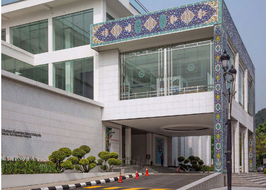
Image 1 The iwan of the Museum, lined with blue tiles commissioned from the ceramist ateliers of Iran. The Open Space Gallery on the ground floor is visible to the visitors from this angle

Once inside the permanent galleries, space division is not part of the architecture: no walls, no partitions, and no closed doors – that was the philosophy of the modern approach. No artificial boundaries; let the boundaries create themselves! This open approach caters first and foremost to a multicultural society, where set boundaries bring with them sets of rules and regulations, limitations, and fear of the unknown behind the doors. Technically the lack of boundaries poses many challenges to the museum, ranging from regulating humidity and temperature to creating invisible space divisions.