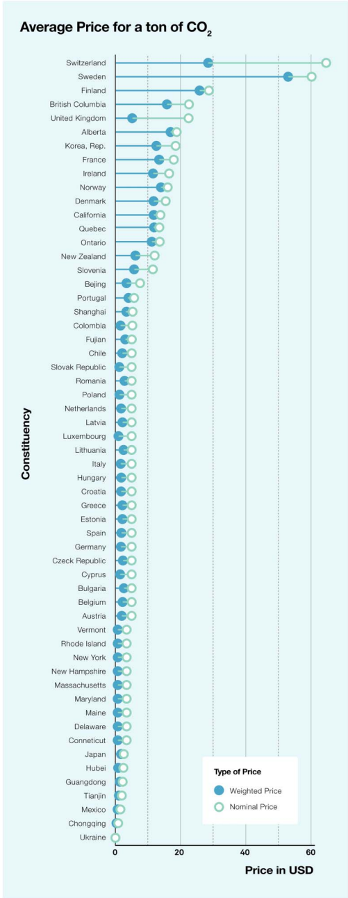
Figure 2 Weighted and Nominal Carbon Prices

Prices for jurisdictions not displayed are zero.