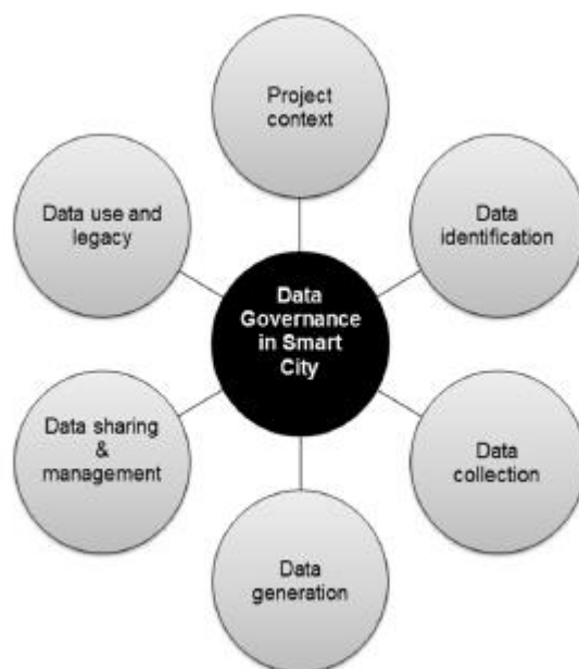
Figure 2. Data Governance in Smart Cities.

One of the most comprehensive approaches is offered by Paskaleva et al. (2017) who develop a framework for the data governance process. This framework consists of six steps: project context, data identification, data collection, data sharing and management, and data use and legacy (Figure 2).