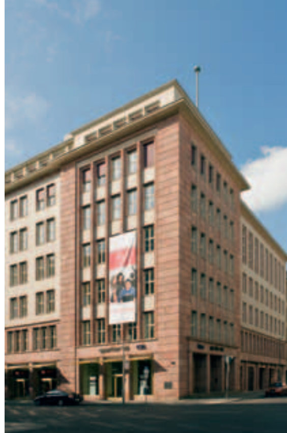
Finally settled in: The new home of the Hertie School of Governance in Berlin Mitte, Friedrichstraße 180.