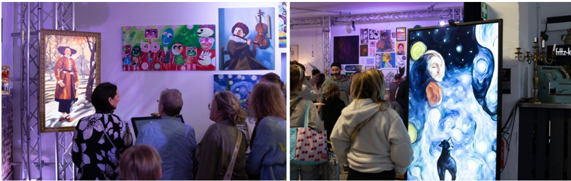
Figure 1: Generating paintings and detecting objects and people in real-time with this look.