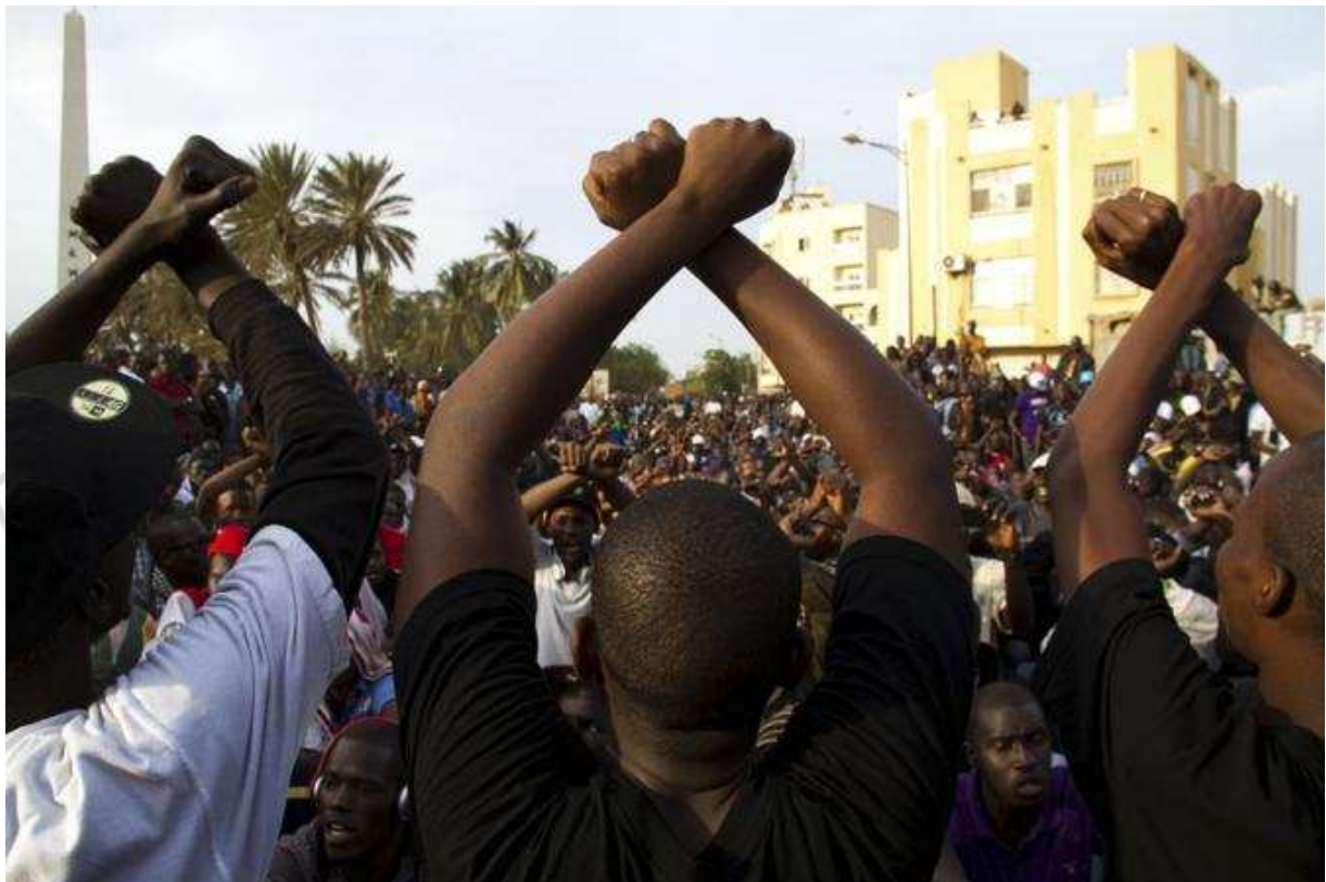
Figure 3 – Protestors of the Y'en a Marre Movement, arms crossed

Y'en a Marre has grown into 423 satellite groups called “Esprit” (spirit) (ibid.). The Esprits are local groups who are carrying out the work and ideas of Y'en a Marre in their urban districts or villages (Prause 2013: 27). They are not only mobilising for large demonstrations, but at the same time organising smaller protests, discussions, or concerts autonomously (ibid.). The fact that the Y'en a Marre movement can fall back on these independent satellite groups operating throughout the country, gives them the opportunity to plan field activities across the nation aimed at social and economic development (Lo 2014: 37). The field activities emerge from local Esprit groups who propose solutions to issues they consider important in their local area and try to find NGOs with funding agendas which match these proposed solutions in order to realise their ideas (ibid.). This mode of development lies at the core of Y'en a Marre 's “New Type of Senegalese”.