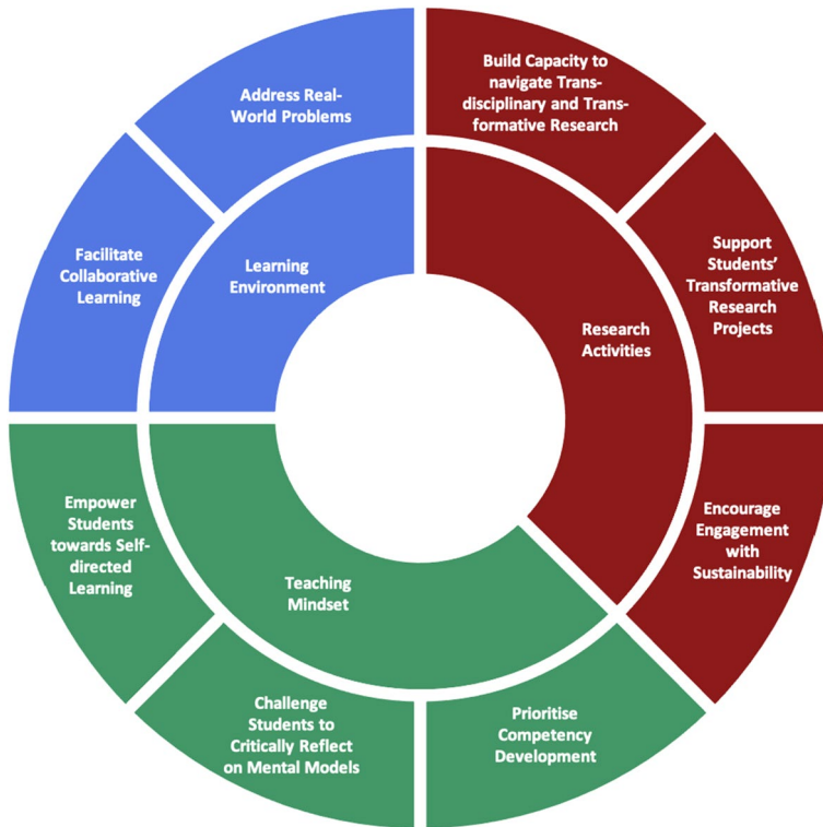
Fig. 2 Depiction of the eight design principles for higher education sustainability learning through transformative research (outer ring) and their superordinate key areas of course design (inner ring). The circular arrangement without hierarchy or numbering is intended to depict our understanding of all the principles as being part of a coherent and equally important set

et al., 2018) and to create adequate learning opportunities, rather than to focus on specific content inputs (de Haan, 2008; Rieckmann, 2012; Stibbe, 2009). It is crucial to foster an empowering teaching mindset towards students, encouraging them to take responsibility for their own learning journey while providing a safe space to learn in experimental settings. This includes guidance for reflection, as well as self-care and emotional coping strategies.