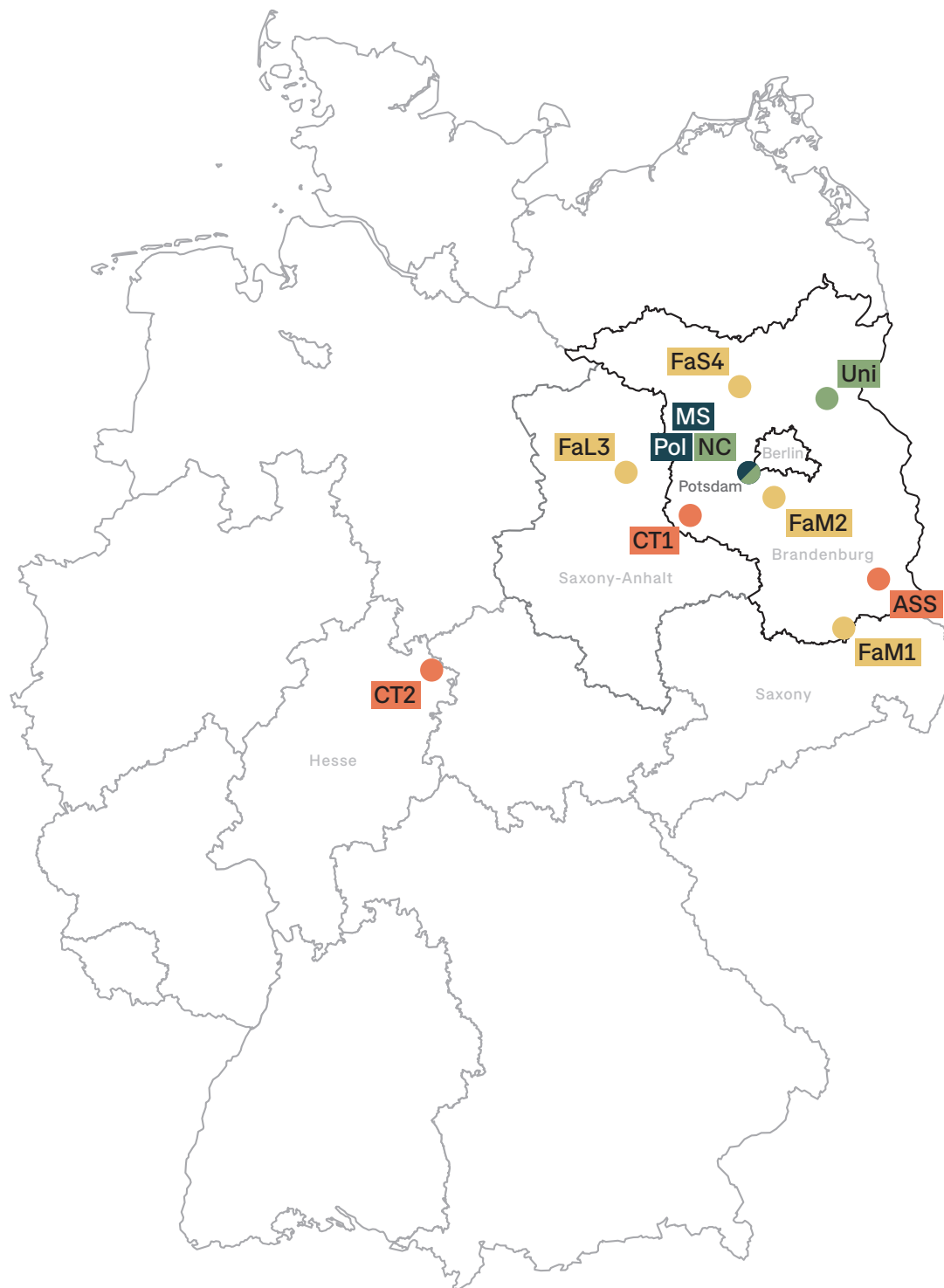
Figure 1. Location of the key actors interviewed on a map of Germany with Uni = Eberswalde University for Sustainable Development, FaS4 = small-sized farm, FaL3 = large-sized farm, FaM2 = medium-sized farm2, FaM1 = medium-sized farm1, Pol = politician, NC = nature conservation organization, MS = state ministry, CT2 = consultant2, CT1 = consultant1, ASS = German association for agroforestry.