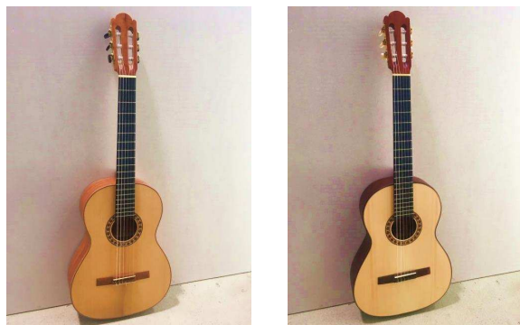
Fig.1: The two analysed guitar models, on the left side thermally modified wood and on the right side tropical wood guitar