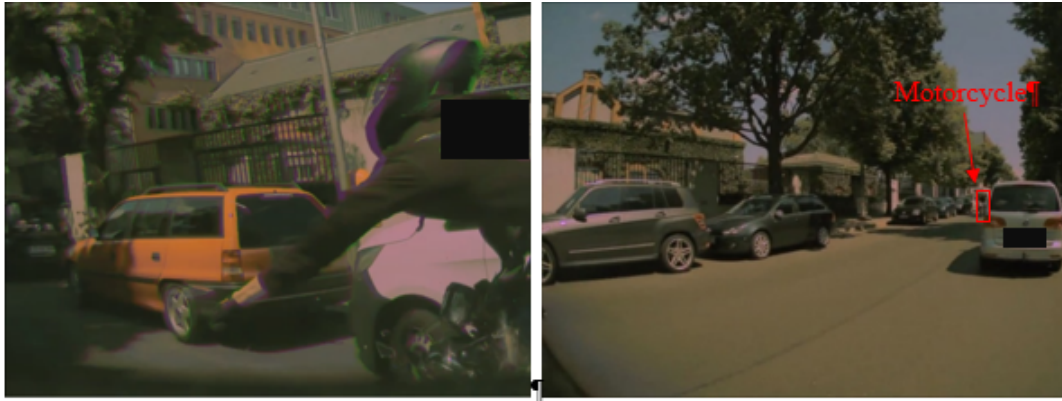
Figure 3: Freeze frame of system video (front camera) at immediate point of collision (left) and visual occlusion by VW Touran approaching from forward looking flank-mounted camera (right).

sified the motorcycle as a hazard - would be very useful for further accident analysis. A reaction point of the vehicle could be determined and avoidance scenarios by the vehicle could be examined with a correspondingly complex virtual simulation. In this way it can be proven whether the accident was avoidable or unavoidable for the system.