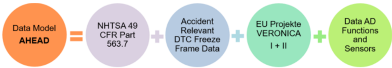
Figure 2: Structure of the AHEAD data list. Source: [20].

sites of Technische Hochschule Ingolstadt (indoor test facility and outdoor test site) and on the site of the DEKRA Automobile Test Center (DATC) in Klettwitz, Germany.