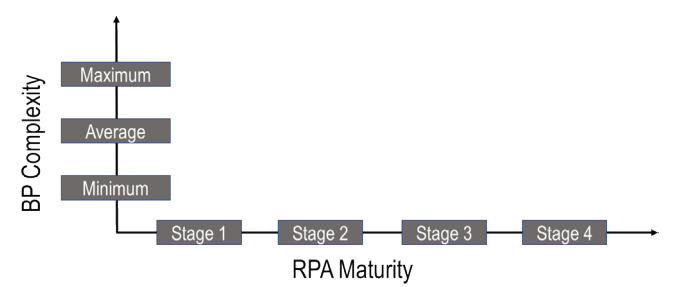
Figure 3 Robotic Process Automation Portfolio

The area between the X-axis and Y-Axis is divided into four quadrants: Long-Term Improvement, No Brainer, Must Do Improvement, and Ouick Wins (see Fig. 4). The values or the proportion of the area covered by each of these quadrants is 25% each and equally. The maximum value that "No-Brainer" quadrant will take is X = 0.5 and Y = 0.5, so, any business processes whose X and Y values are under these maximum values will be treated as "No-Brainer" projects. "Long-Term Improvement" quadrant will take X = 0.5 and Y= 1, so, any business processes whose X and Y values are under these maximum values will be treated as "Long-Term Improvement" projects. "Must-Do Improvement" quadrant will take X = 1 and Y = 1, so, any business processes whose X and Y values are under these maximum values will be treated as "Must-Do Improvement" projects. Finally, "Quick-Wins" quadrant will take X = 1 and Y = 0.5, so, any business processes whose X and Y value are under these maximum values will be treated as "Quick-Wins" projects.