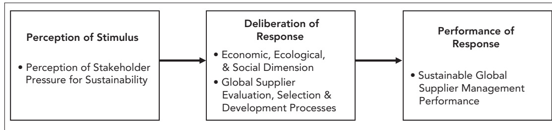
FIGURE 1 Research Model (adapted from Litz 1996)

business practices can improve firms' operational processes and decrease risk exposure to negative publicity and reputational damage, ultimately leading to enhanced competitive advantage (Christmann 2000; McWilliams and Siegel 2001). Owing to the growing influence of CR on corporate strategy decisions and the increased reliance on a global supplier base as part of global production networks, it has become imperative for the PSM function to deal with green and social issues in global sourcing processes and decision making (Carter and Rogers 2008; Pagell and Wu 2009).