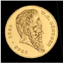
The Röntgen Medal

2 Deutsches Röntgen Museum, D-42897 Remscheid, Germany