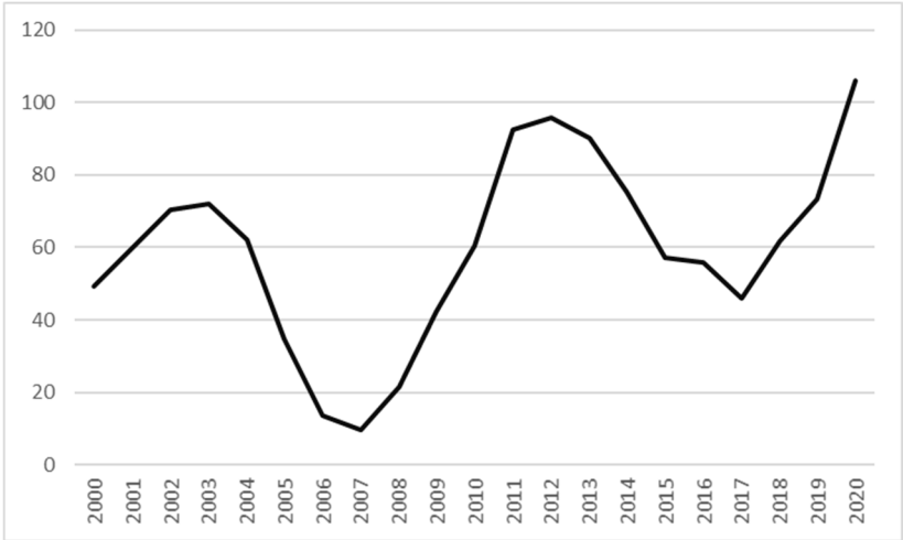
Figure 1: Outstanding IMF loans (SDR billion)

However, the IMF had no clear and elaborated concept for a sovereign debt and financial crisis in more advanced member countries of a monetary union. In the past, many IMF reform programs have been successful when combined with a depreciation of the national currency and monetary policy measures. The IMF treats each country as a sovereign state and calls for reforms in many policy areas that are under the country's control. In contrast, in a monetary union, only a limited policy area can be tackled by the IMF, which means that not all of a country's economic problems can be effectively addressed (Nelson 2017), p. 9). Since the European officials excluded a country's exit from the currency union for fear of collapse of the whole system, the policy instruments of national monetary and exchange rate policy were not available. Thus, for example, a (temporary) exit of Greece from the monetary union with the aim of a devaluation to (re-)establish international price competitiveness quickly, as Sinn (2015, p. 480ff.) suggested, was not possible. The IMF broke new ground and took big risk. It moved from a Fund to tackle short-term balance of payments problems to a Fund to solve long-term structural problems. This might be one reason why the IMF tried to withdraw more and more from being an active part in the Troika.