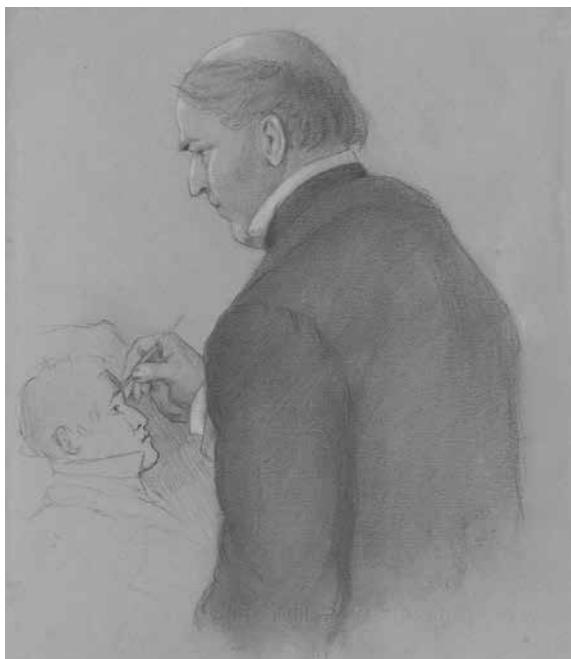
Fig. 7 Leopold Kupelwieser. Drawing. Austrian National Library. (with kind permission of the Austrian National Library).