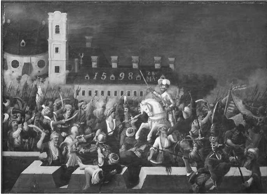
Fig. 4 Alajos Unger: The recapture of Győr. 1840. Oil on canvas. Hungarian National Gallery. 47 x 65 cm, Inv. No. 70.214 T