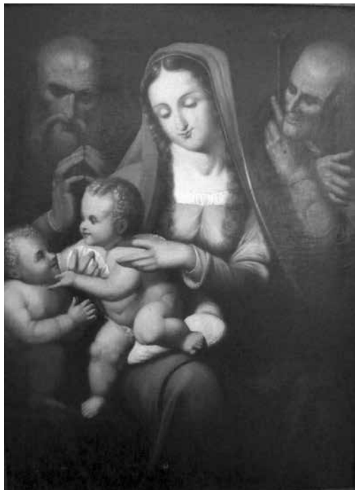
Fig. 2 Alajos Unger. Copy of La vierge au bas-relief by Cesare da Sesto, oil on canvas c 80 x 90 cm. Unknown date. Private ownership.