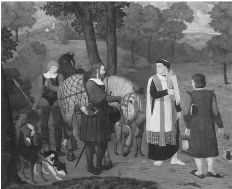
Fig. 11 Franz Pforr: Rudolf von Habsburg and the Priest. 1809/10. Städel Museum Frankfurt-on-Main. Oil on canvas. 45.5 x 54.5 cm. wikipedia.com