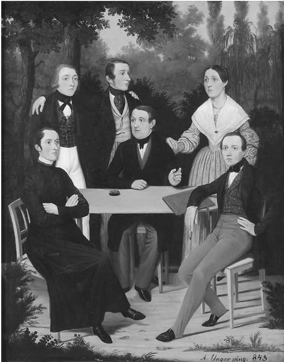
Fig. 1 Alajos Unger: The artist and his family. Late Nazarene family portrait. (1843). Oil on canvas mounted on wood. Hungarian National Gallery. 72 x 57 cm, Inv. No. 74.83 T