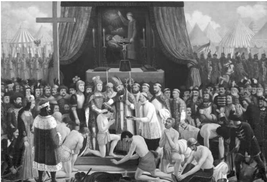
Fig. 5 Alajos Unger: The Baptism of Vajk. (1842, ascribed). Oil on canvas. 130 x 180 cm. Private ownership