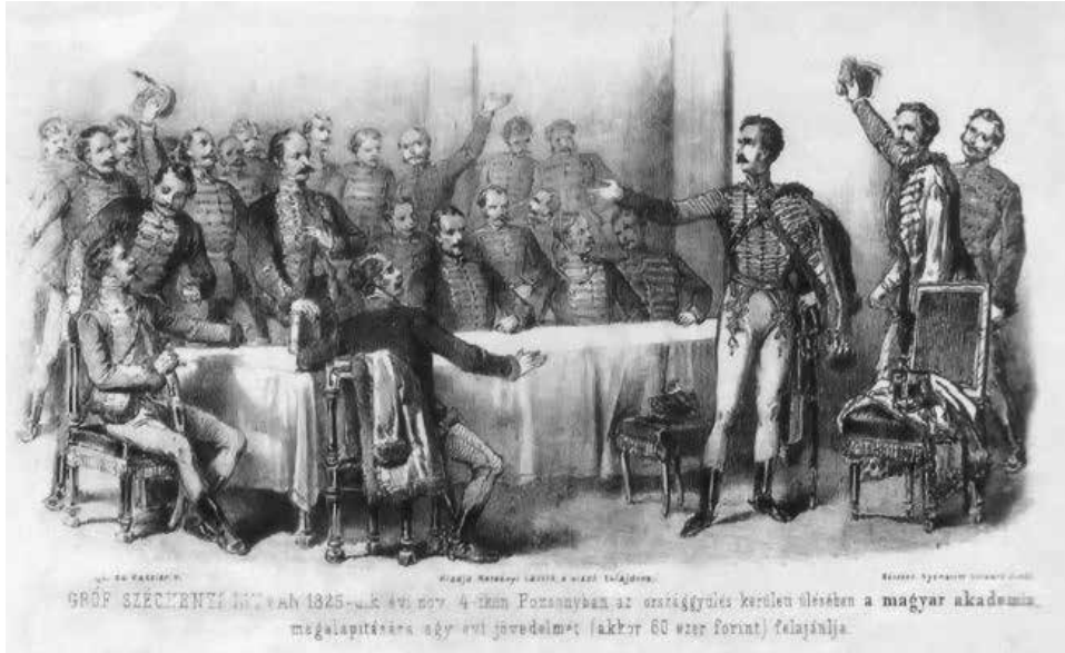
Fig. 6 Count Szechenyi and Magnates at the Diet of Pozsonyi offering one year's income of his estate to establish and endow the Hungarian Academy of Sciences (wikipedia.com, s.v. István Széchenyi). c 1860. Lithography by Vinzenz Katzler.