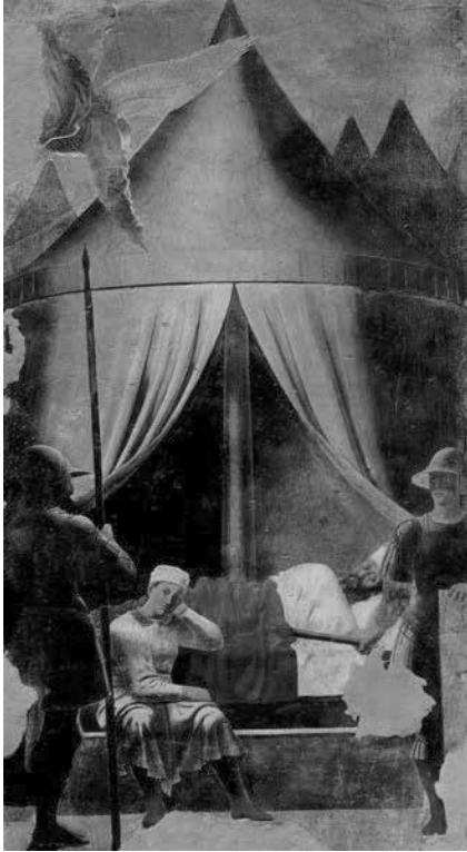
Fig. 12 Piero della Francesca: The dream of Constantine, probably 1452-56, a fresco from the History of the True Cross cycle in Arezzo, Italy. wikipedia.com