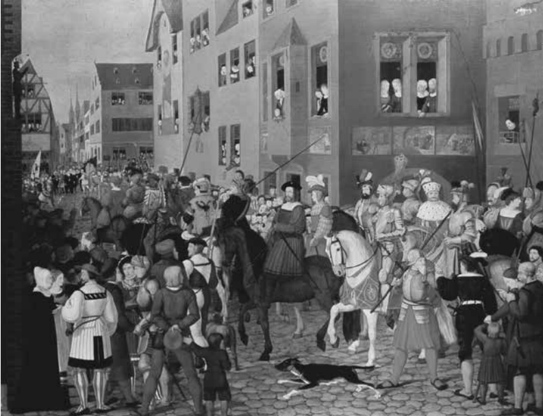
Fig. 8 Franz Pfors: The entry of Rudolf von Habsburg into Basel, 1809/10. Städels Museum Frankfurt-on-Main. Oil on canvas. 90 x 119 cm.