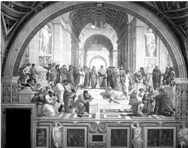
Fig. 9 Raffaello Sanzio: The School of Athens. 1510/11. Fresco. Vatican.