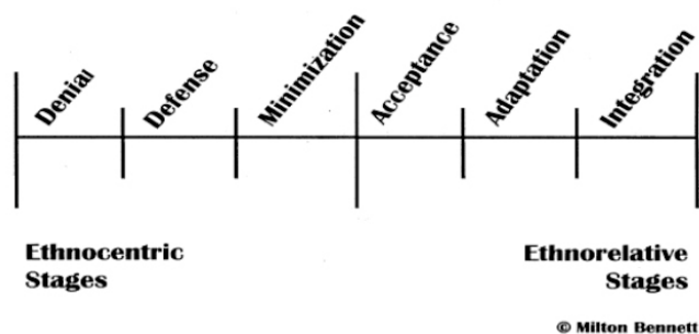
Figure 1: The Milton Bennett scale

The Bennett scale is a convenient model to rate the degree of ethnorelativity from low (the individual display ethnocentric behaviours) to high (the individual display full integration to another culture) (BENNETT, 2011).