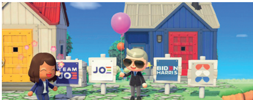
Figure 2: Joe Biden’s ACNH campaign

During the US presidential election campaign, Senator Biden tried to capitalize on the game’s popularity by launching a virtual field office for voters and designing downloadable yard signs that could be used by game players (Taylor & Ortiz 2020, Kelly 2020). Figure 2 gives an impression of the yard signs. Also, the Democratic Representative Ocasio-Cortez followed this trend when she visited supporters’ islands (Nagumo 2020). The game is a good example of a two-sided platform: 12 On the one side, the huge numbers of players and their involvement makes ACNH interesting for Biden’s campaign. On the other side, the addition of yard signs also helps gamers to decorate their gardens and to express their political standpoint. Both sides profit from the existence of each other (Osterwalder & Pigneur 2010).