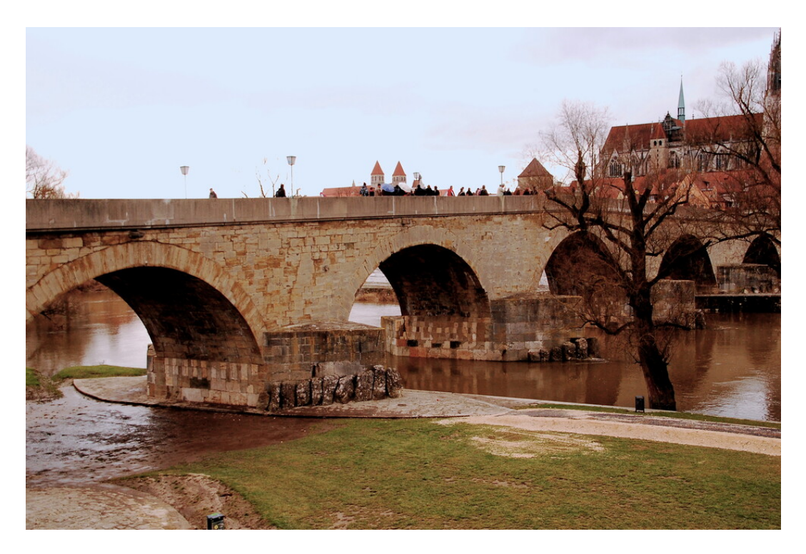
Fig. 2: Old town of Regensburg with Stadtamhof

Regensburg, a historic town in Bavaria situated along the Danube River, boasts a plethora of meticulously crafted structures that serve as a testament to its role as a prominent commercial hub that has exerted influence over the region since the 9th century. The town's architecture is a blend of Gothic, Romanesque, and old Roman styles that originated about two thousand years ago. The architectural style from the 11th and 13th centuries in Regensburg, which encompasses the cathedral, city hall, and market, still shapes the city's distinctive attributes, such as tall structures, dimly illuminated streets, and robust defences. Notable features include the Old Bridge, which originates from the 12th century, as well as other churches, towers, and mediaeval noble residences. Regensburg now has a population of around 175.000 citizens, making it the fourth-largest city in Bavaria (Stadt Regensburg - Deutsch - Bürgerservice, no date). Regensburg has seen the most significant population growth among all the model projects. This is apparent from both historical statistics and estimates up to 2025, which suggest a 5.4% anticipated growth in the population (UNESCO World Heritage Centre, no date b).