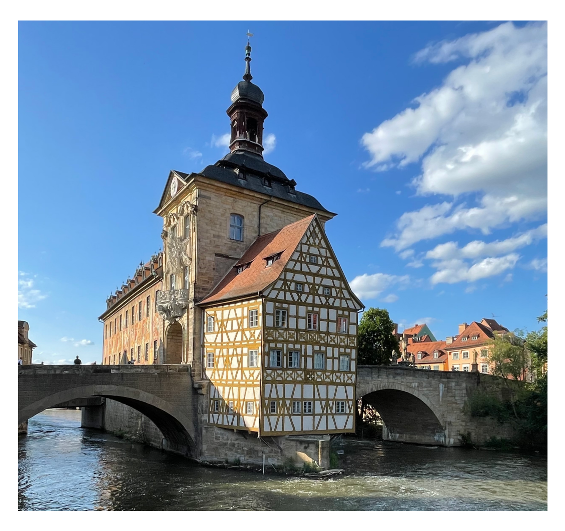
Fig. 3: Town of Bamberg

Bamberg is located in the northern part of Bavaria, which is in the southern area of Germany. Featuring several well-preserved ecclesiastical and secular monuments from the mediaeval period, the town is organised into three distinct sections: the City on the Hills (Bergstadt), the Island District (Inselstadt), and the Market Gardeners' District (Gärtnerstadt). It serves as an excellent illustration of a central European town with an early mediaeval design. In 1007, Henry II, the Duke of Bavaria, designated Bamberg as the episcopal centre with the intention of transforming it into a "second Rome". The interplay between agriculture, including vineyards and market gardens, and the urban distribution hub in the present town is particularly captivating, as noted by the UNESCO World Heritage Centre (no date).