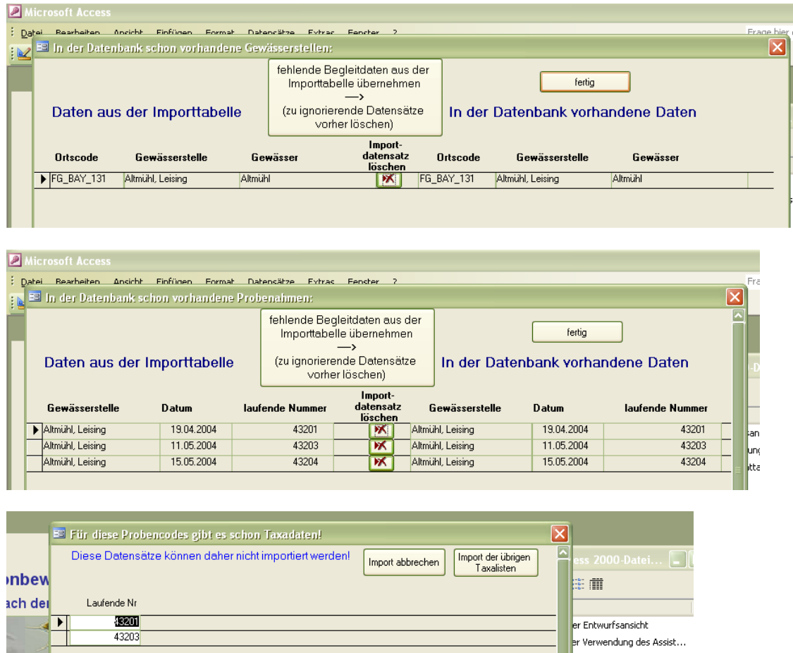
Figure 3: Warning/Error messages given by the PhytoSee tool if data to be imported already exist in the database. This prevents the entering of duplicate records.

When entering data manually, it is very important to pay attention to the column order in the prepared Excel table, which must be identical to the Access table. If the column order is incorrect in the Access file, this can be easily rearranged to match the template: columns can be dragged and dropped while in the Access "table view". [Note: The column order in table "Gewässername_SeeNr" ( Waterbody-name_LakeNo ) is different in PhytoSee 6.0 Version 26.01.2015 to that in the data format template. This will be corrected in the next update.]