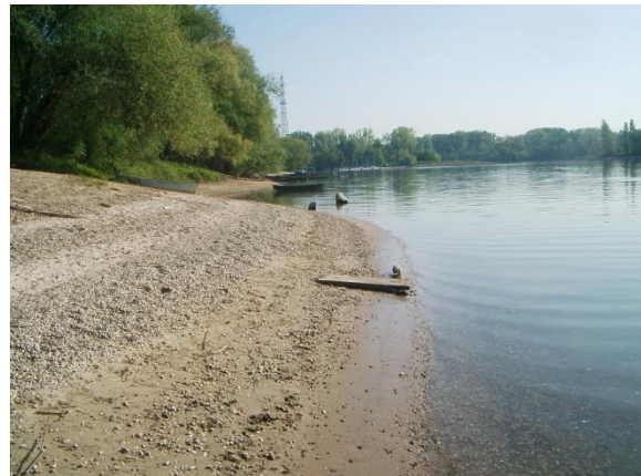
Baggersee Otterstädter Altrhein

Finanzierung durch das Länderfinanzierungsprogramm "Wasser, Boden und Abfall"