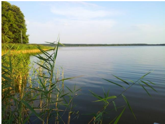
Großer Labussee