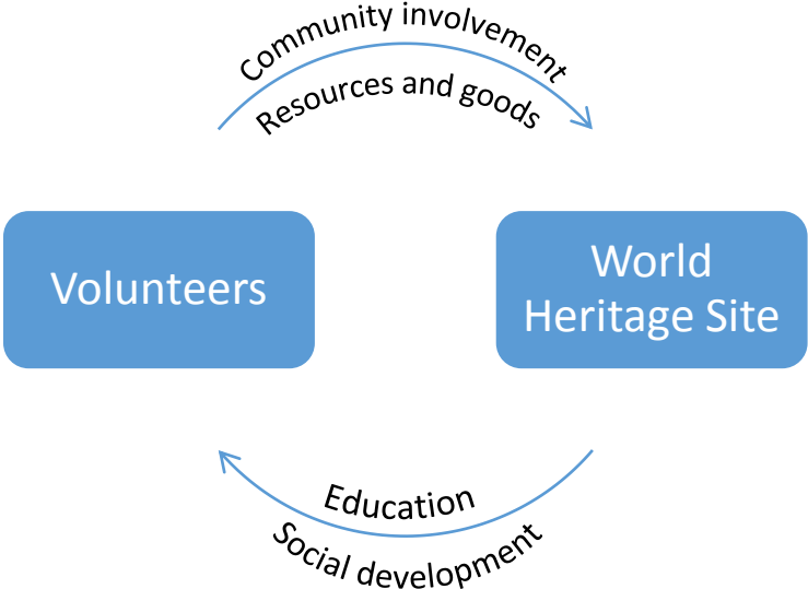
Figure 1. Mutual benefits for volunteers and a World Heritage Site

natural heritage“ (Art. 27). Similar to the World Heritage Volunteers project host community-based volunteering becomes an educational tool. Consequently, a World Heritage site has a purpose to become an “intellectual leader” and not just use volunteers as additional resource but to facilitate their education and personal development. The following scheme shows relationships between volunteering and a World Heritage site beneficiary for both: