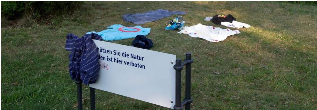
Figure 3. The indifference of some Potsdam inhabitants in the New Garden. The sign's inscription: „Protect the nature. Swimming is forbidden here”

additional security staff for another €150.000 as well as to arrange cleaning of the littered bathing area at Heiliger Lake for €70.000 per year (ibid.).