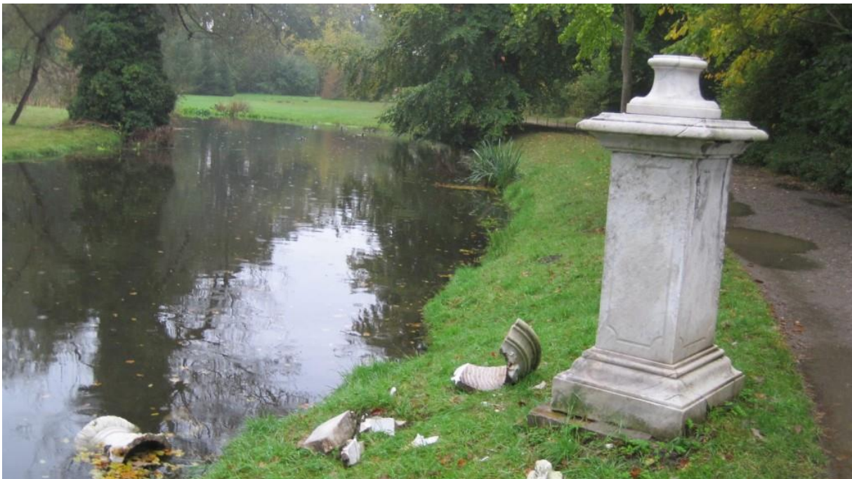
Figure 4. Vandalism in the Sanssouci Park. The 250 years old marble vase was broken into pieces

Furthermore, every year the foundation registers in Potsdam numerous vandalism cases of varying severity from picking flowers and graffiti to serious damages of sculptures in parks. In October 2014 the public was shocked when a 250 years old marble vase was broken into pieces in the Sanssouci Park. As stated in an interview with Frank Kallensee, a spokesman of the SPSG, “Compared to last years the number of vandalism cases increased” namely 172 cases in 2014, which is more than in last 4 years combined ( B.Z. Berlin Nachrichten , 21 October 2014). The foundation had to increase reparation costs from €130.000 to €200.000 pro year (ibid.).