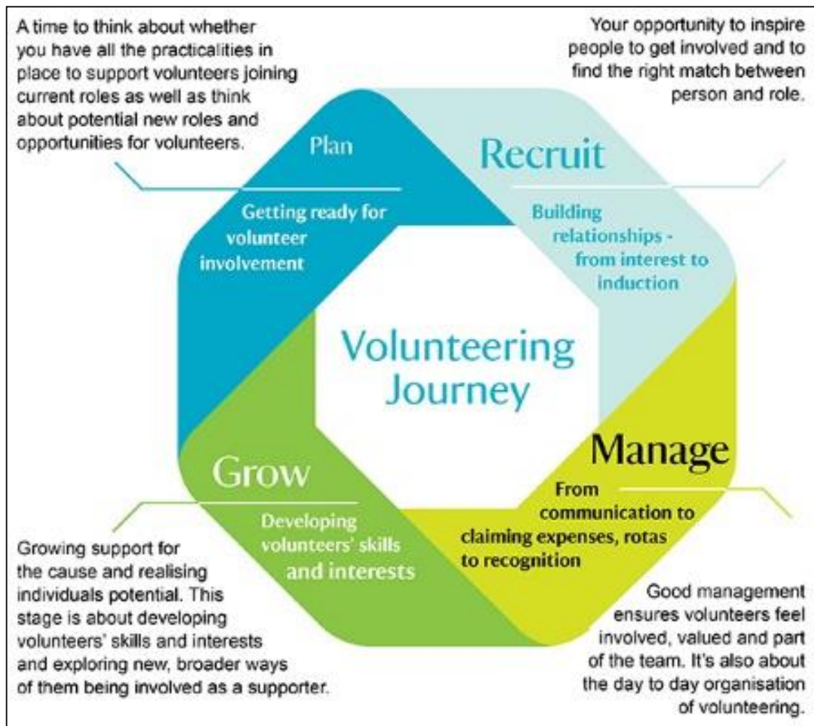
Figure 5. The National Trust Volunteering Journey Project Circle

Combining both the typical project lifecycle and the model used by the National Trust the presented study suggests the following stages of volunteer involvement at the SPSG: Planning, Recruiting & Selecting, Training, Implementation, Recognition & Evaluation. (Figure 6. The Volunteer Involvement Life Cycle). It is important to notice that training can be provided on the different stages of the programme, as an orientation activity in the beginning of the project or in the form of educational seminars during and after execution phase.