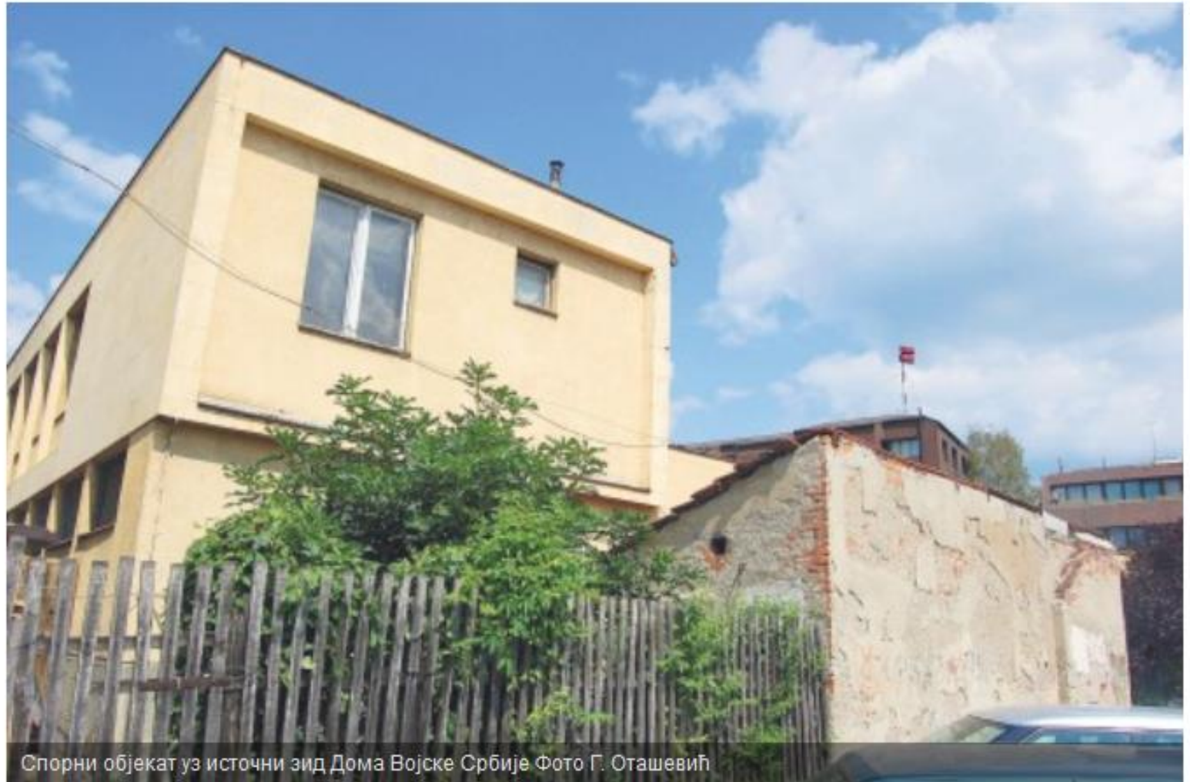
Спорни објекат уз источни зид Дома Војске Србије