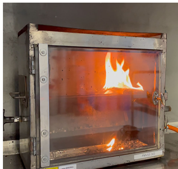
FIGURE 2 Fire test according to Appendix VI of UN ECE R 118, on a rubber material fulfilling the requirements.

the test according to Appendix 7 of UN ECE R 118: A sample is placed in a horizontal position and is exposed to an electric radiator. A receptacle is positioned under the specimen to collect resultant drops. Some cotton wool is put in this receptacle in order to verify if any drop is flaming. In the drip test the specimen is located on a horizontal grate which is fixed 300 mm over the bottom and 30 mm below an electrical heater which radiates a thermal intensity of 30 \text{ kW/m}^2 to the specimen. During the test period the ignition and the drip behaviour of the specimen and the underlying cotton ball are monitored for 10 min. If the specimen ignites in the first 5 min of the test the electrical heater must be immediately removed within 3 s until the flame vanishes. After these five test minutes or after the flame vanishes, the specimen is radiated for another 5 min without stops when the sample ignites again. The requirements are fulfilled if the cotton ball was not ignited by burning drips during the test (Figure 1).