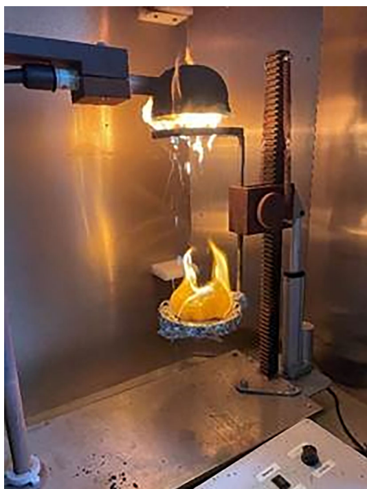
FIGURE 1 Dripping test (Appendix 7 of UN ECE R 118).