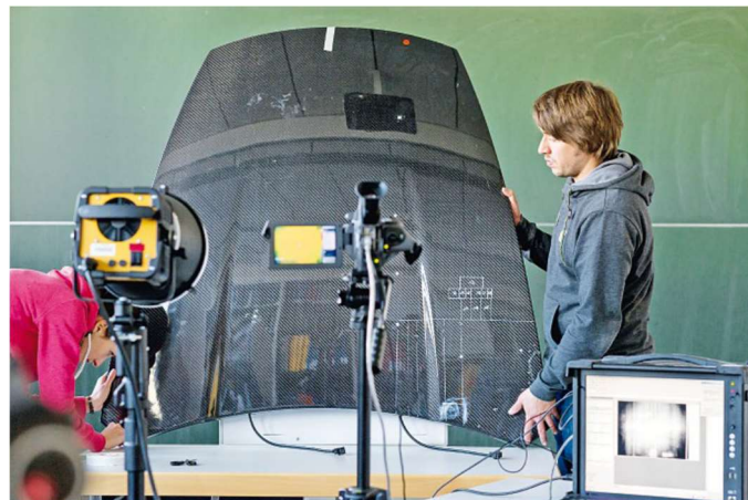
Figure 5: Student's exercises with infrared thermography applied to a car hood out of CFRC [1]

Practical work in laboratories and tutor-guided exercises represent a central element of NDT-CE courses. They can be easily combined with other teaching formats such as lectures and enable students to design and carry out measurements themselves and to evaluate and interpret the recorded data (fig. 5). Since it can take a long time, such kind of exercises should be prepared with great care. It is a good idea to hand out exercise sheets or tutorials for preparation and to keep measurement protocols for the individual tasks. Attention should also be paid to any necessary compliance with safety measures (safety briefings).