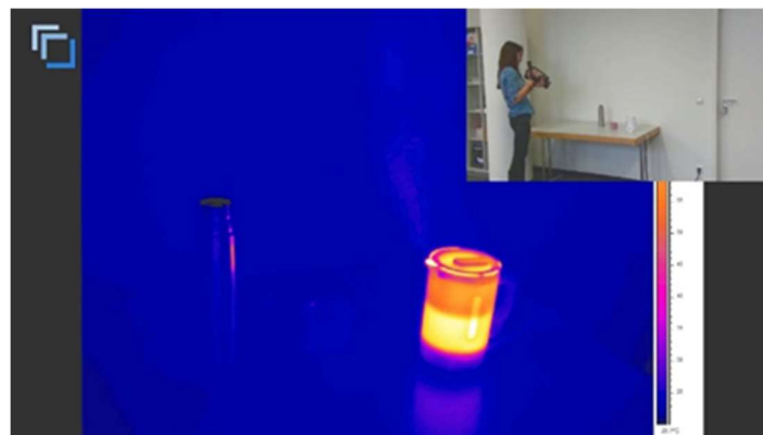
Figure 3: Educational video of TU Munich demonstrating infrared thermography measurements [1]

Lectures can be provided as Massive Open Online Courses (MOOCS) or eLearning modules (fig. 3). This has the advantage that expensive or immobile NDT-CE processes can be integrated and time-consuming measurements can be displayed in a compressed manner.