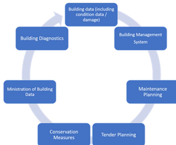
Figure 1: Building diagnostics within the building maintenance process [1]

Non-destructive testing in civil engineering (NDT-CE) is an interdisciplinary field in the best sense of the word [2, 3] that is embedded in the process of building maintenance as part of a material spanning building diagnostics respectively inspection [4, 5] (fig. 2).