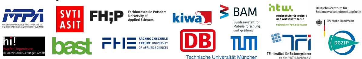
Figure 1: Organizations working on DIN 4871

After several meetings of intensive discussions about a goal-oriented approach considering the diverse experience of experts from the industry, research institutes and practitioners it was decided to submit an application for the establishment of a standardization project to the standards committee for Materials Testing (NA 062) of the German Institute for Standardization DIN (DIN NMP). After preparing a roadmap and a draft of the standard for the qualification of NDT-CE personnel, in 2020 a vote took place in the DIN NMP that approved the establishment of a national standardization project. So based on the draft, the work on the standard DIN 4871 “Non-destructive testing – Qualification of NDT personnel in Civil Engineering (NDT-CE)” could be started in June 2020 with the support of the organisations represented in Figure 1. The expected timeline was to not exceed the duration of 3 years from the beginning of the project until the final publication of the standard.