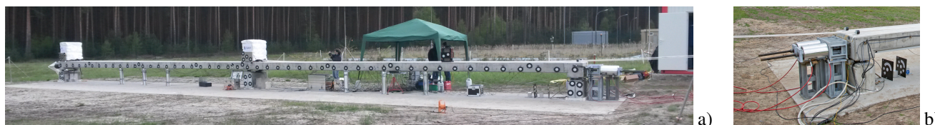
Fig. 1: BAM two-span prestressed testing bridge a and its prestressing device b .

The inverse model calibration problem is reformulated as a Bayesian inference problem [2,4], where the posterior distribution P(\theta|\mathbf{y}) \propto P(\mathbf{y}|\theta)P(\theta) of the model parameters \theta with given measurement data \mathbf{y} is computed as a product of the likelihood P(\mathbf{y}|\theta) and the prior information P(\theta) . The likelihood function is expressed as a probability distribution (multivariate normal distribution) of the model error \mathbf{k} = \mathbf{y} - \mathbf{g}(\theta) , the difference between the measurement data and the model response \mathbf{g}(\theta) . It includes a noise term related to both real measurement noise and model bias.