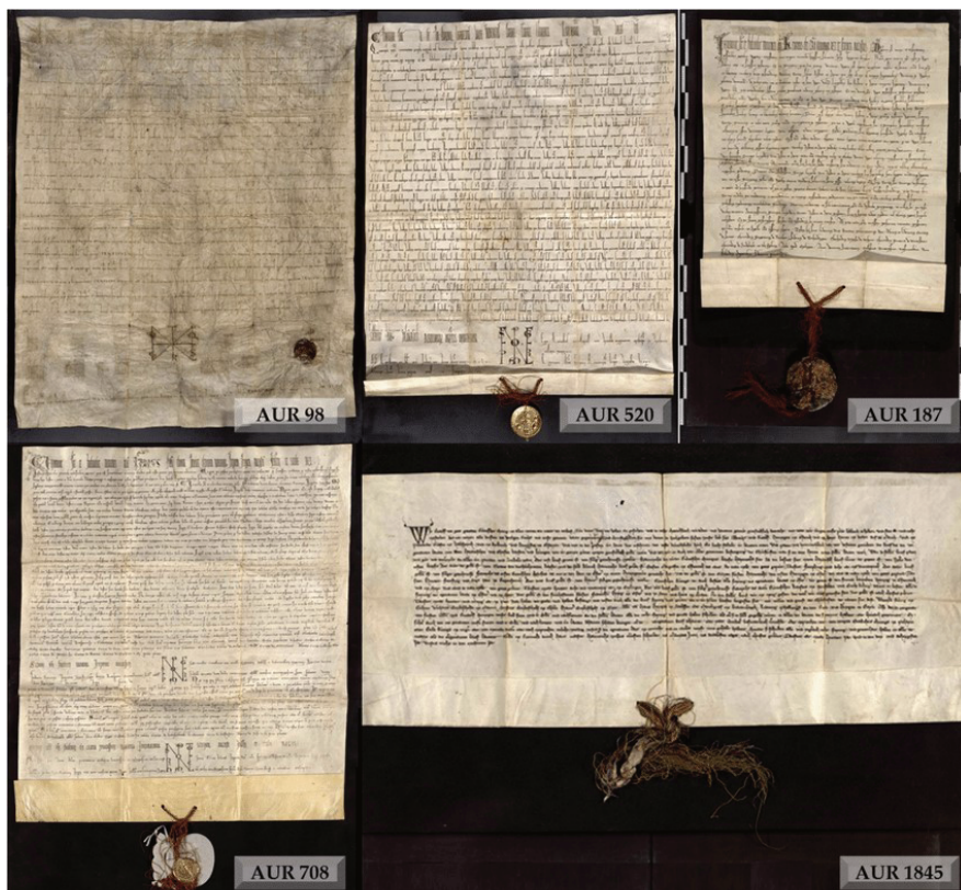
Fig. 3: Five parchment charters constituting the Privilegium maius ; © Österreichisches Staatsarchiv.

shown, however, that all the inks used to produce the documents were different in terms of their relative elemental composition. Furthermore, it was found that the threads were not dyed in the same bath. All in all, one comes to a striking result that the charters were not produced in one stage or even in the same workshop, raising the question how the forgery was conducted.