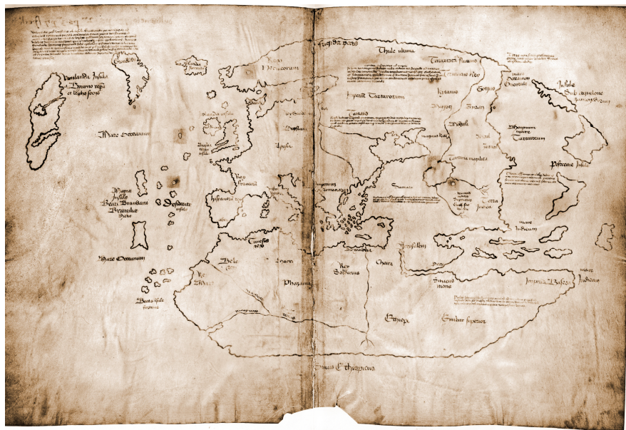
Fig. 2: Vinland Map ( Hystoria Tartarorum ); © General Collection, Beinecke Rare Book and Manuscript Library, Yale University.

In contrast to the previous example, Raman spectroscopy played a decisive role in identifying the Vinland map (Fig. 2) as a modern forgery, thus ending a scholarly debate that had lasted over forty years.